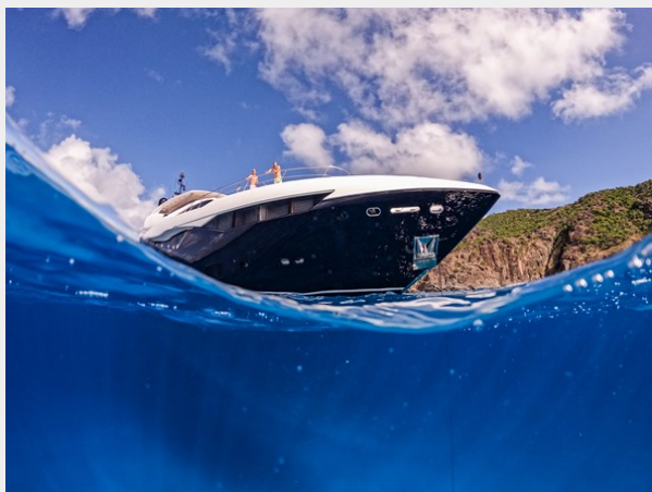
28 - EVER EAST