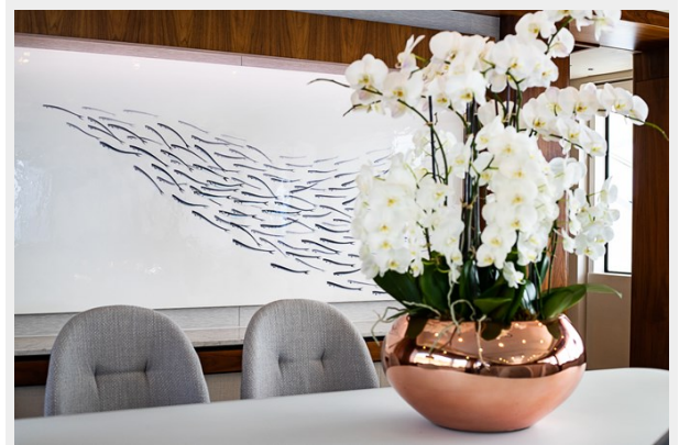
17 - Detail main salon