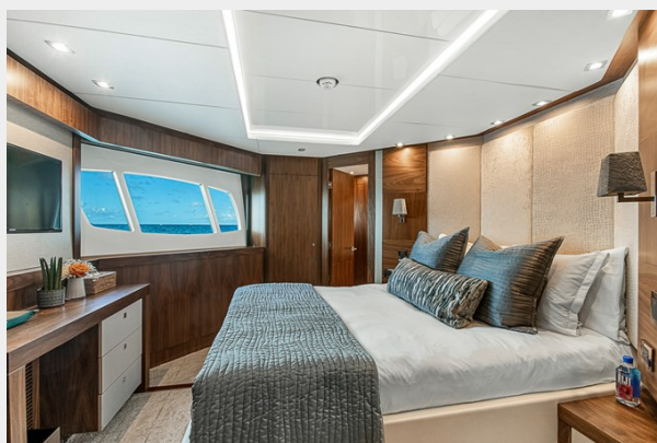
22 - VIP Double stateroom 2