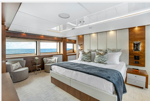
18 - Master stateroom