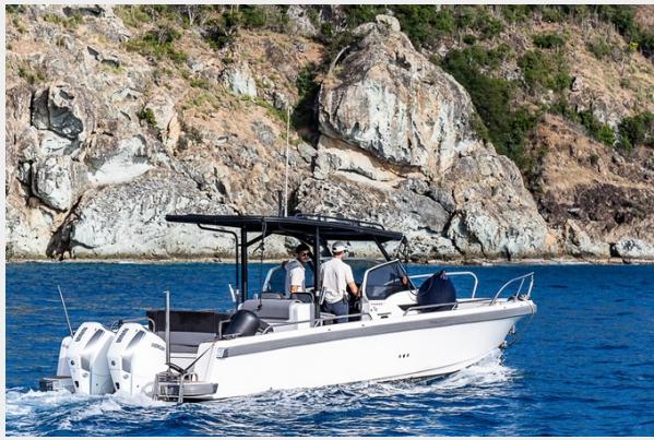
26 - Tender