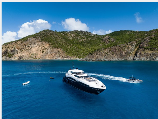
04 - EVEREAST tender and toys