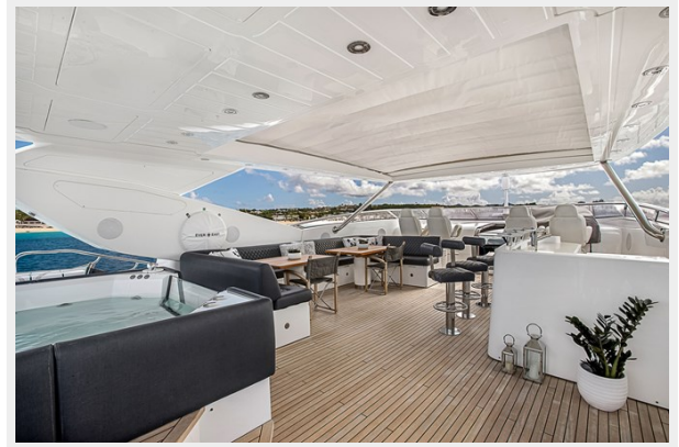
09 - Sundeck