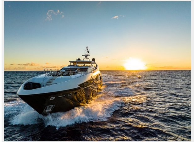
27 - EVEREAST