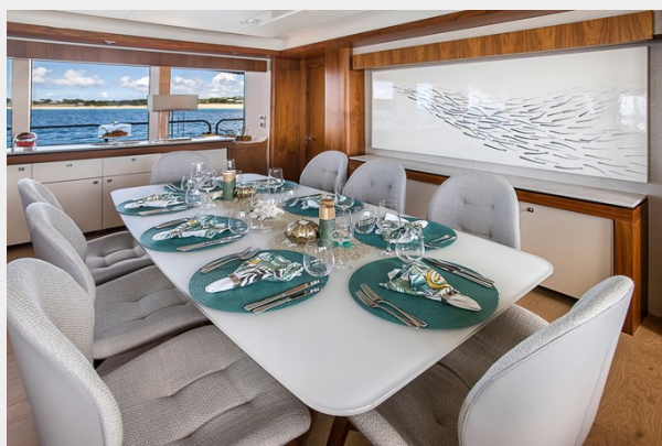
16 - Table in main salon