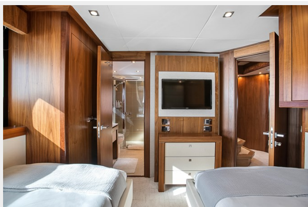
24 - Twin stateroom