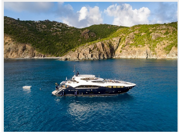
03 - Profile at anchor