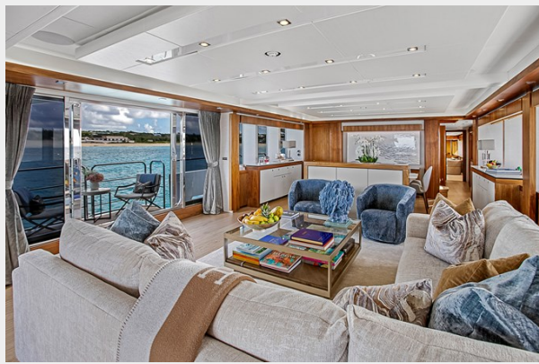
14 - Main salon 2