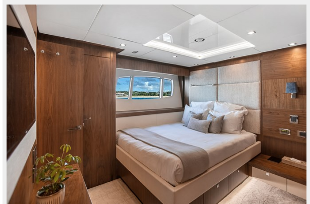
23 - Double stateroom