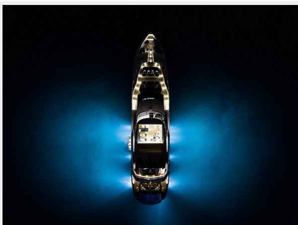
30 - View from above by night