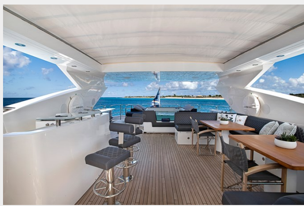
10 - Sundeck 2