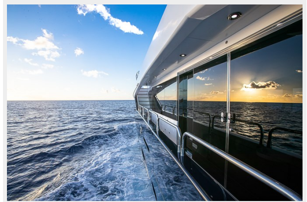
11 - Sliding doors and the sun