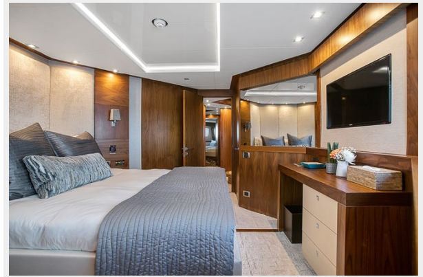
21 - VIP Double stateroom