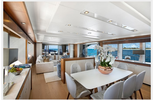
15 - Main salon 3