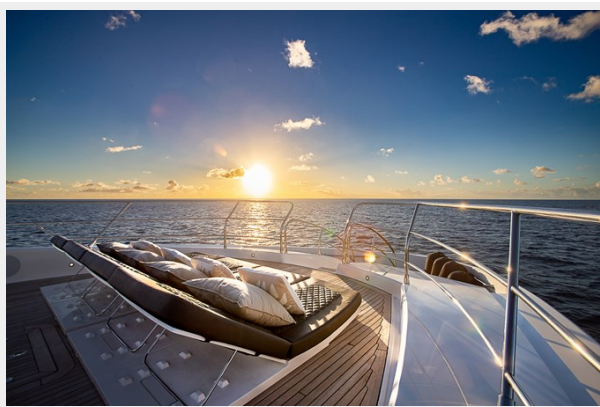
12 - Sun beds in the bow