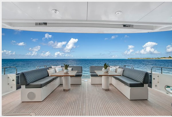
08 - Aft deck seating area