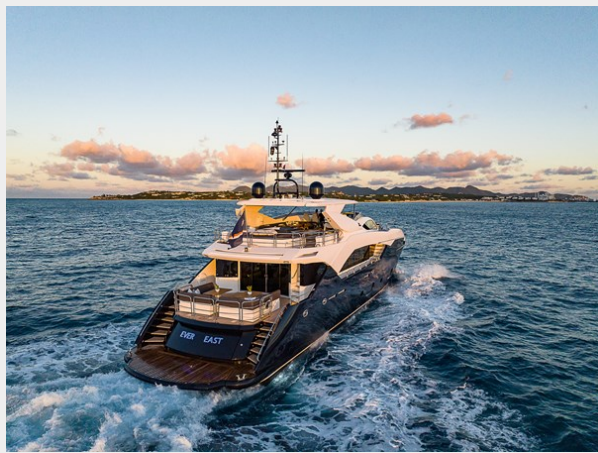
02 - Cruising