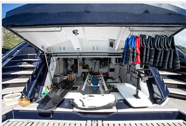
06 - Garage and toys