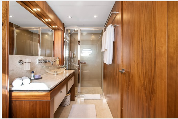
20 - Master bathroom