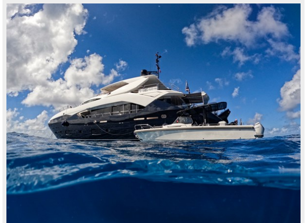
29 - EVER EAST