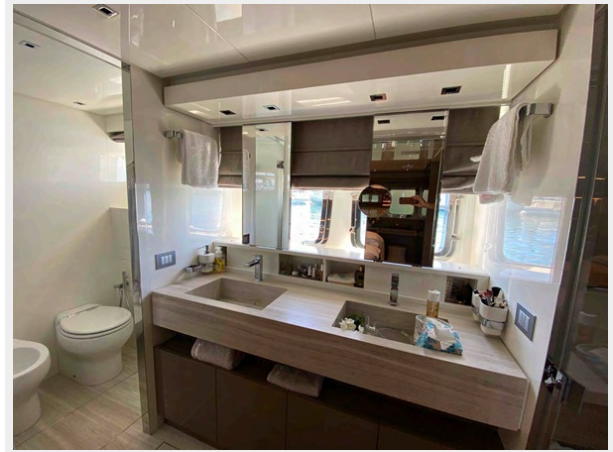
Master Suite Bathroom