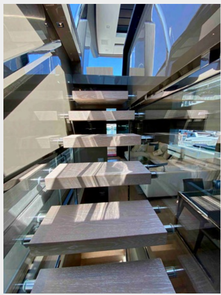
Interior stairs to flybridge