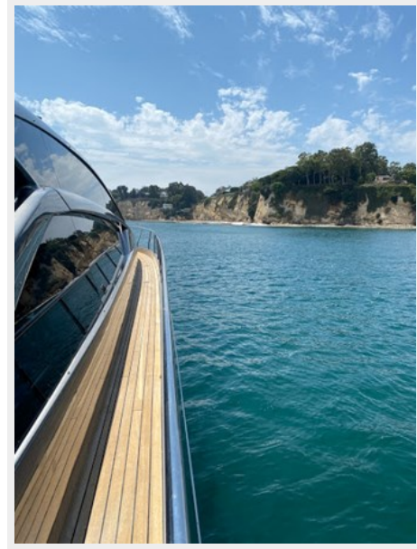
62 PERSHING 2018 - AKULA_2