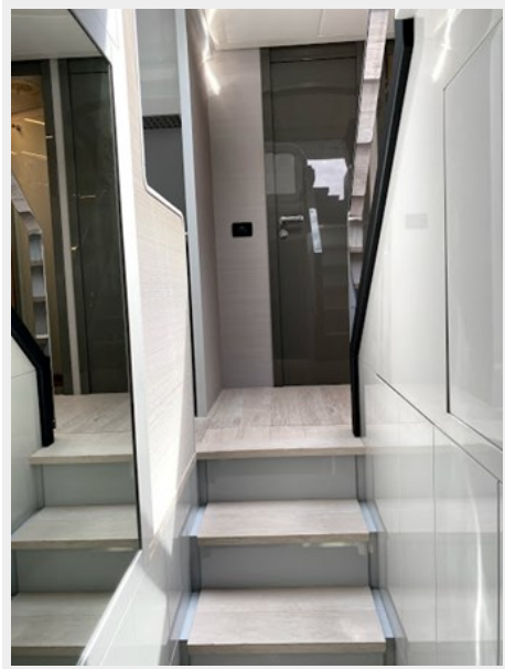
62 PERSHING 2018 - AKULA_6