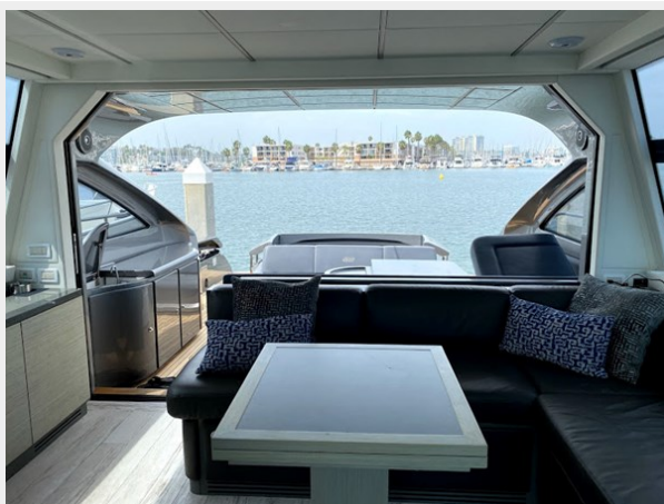
62 PERSHING 2018 - AKULA_5