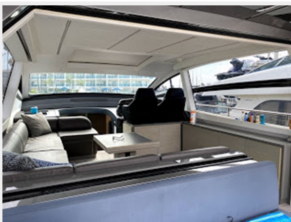
62 PERSHING 2018 - AKULA_11