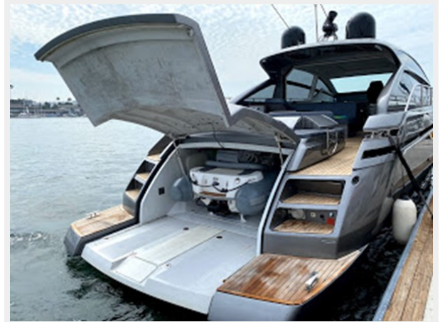
62 PERSHING 2018 - AKULA_10