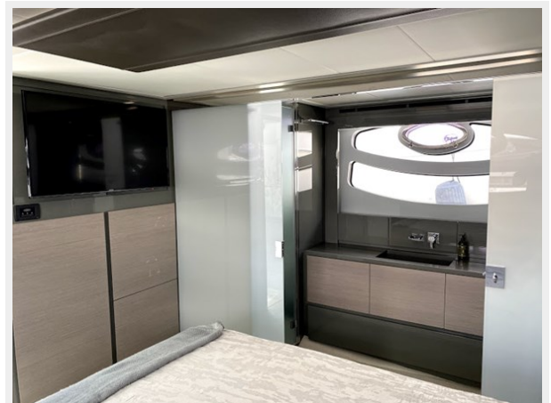
62 PERSHING 2018 - AKULA_7