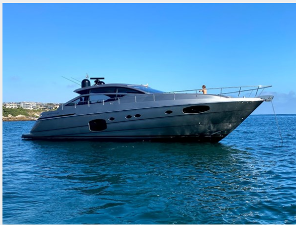
62 PERSHING 2018 - AKULA_1