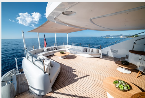
Aft Upper Deck3