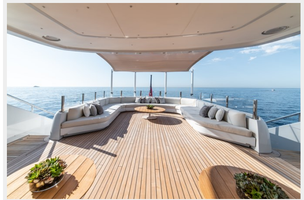
Aft Upper Deck2