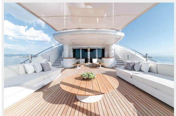
Aft Upper Deck