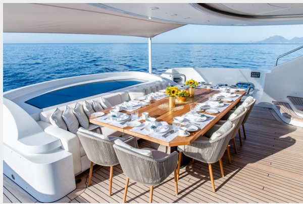
Aft Main Deck