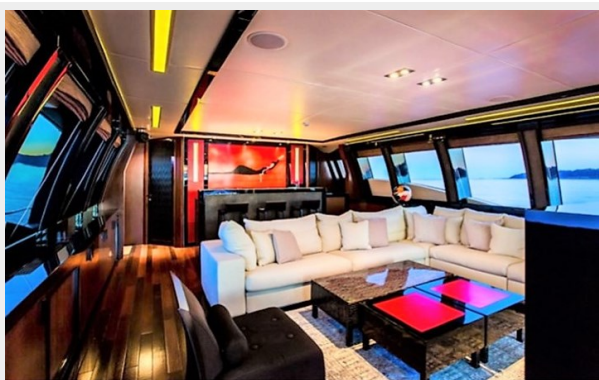
salon fwd view