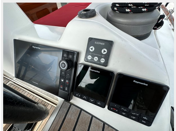
Starboard Helm Electronics