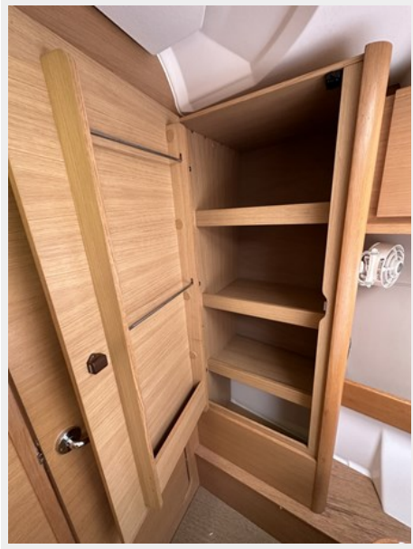
Locker Shelving Forward Cabin