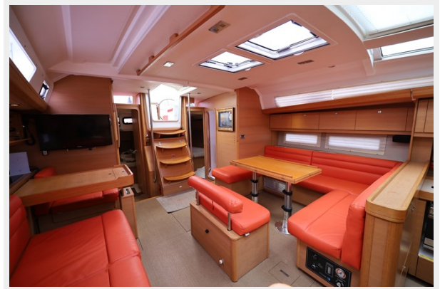
Salon Looking Aft to Port