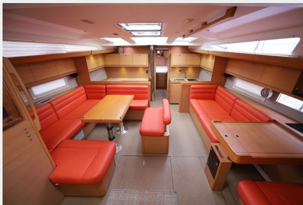
Salon from Companionway