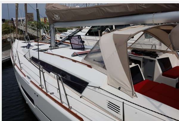
Deck House Profile