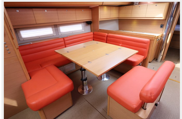
Full Salon Table