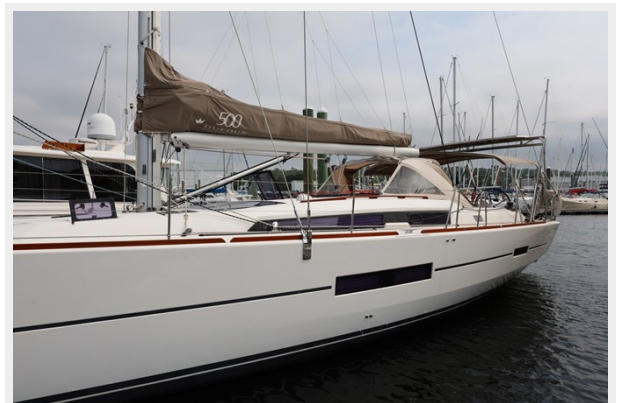
Hull Hard Chine