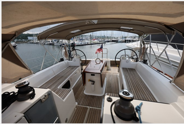
Cockpit from Dodger