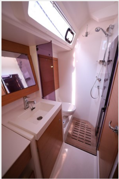
Aft Head and Shower