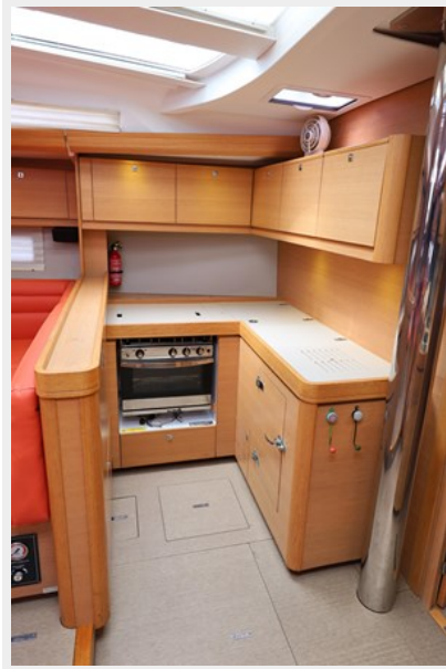
Galley to Port