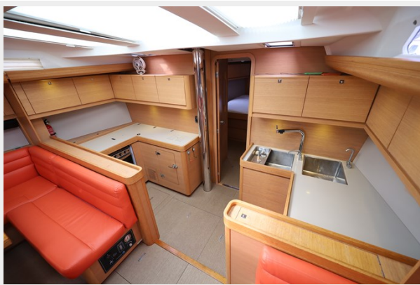
Galley Wide View