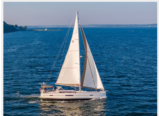
Starboard Beam Aerial View