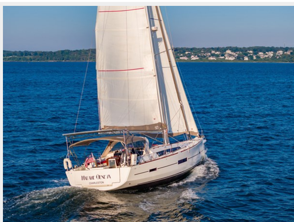
Starboard Quarter from Above