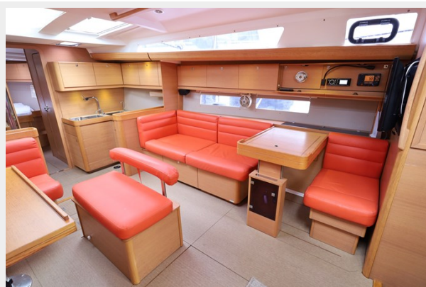
Starboard Salon Galley Forward