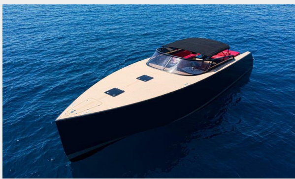
2013 VANDUCTCH 55_3.spec