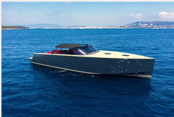
2013 VANDUCTCH 55_1.spec