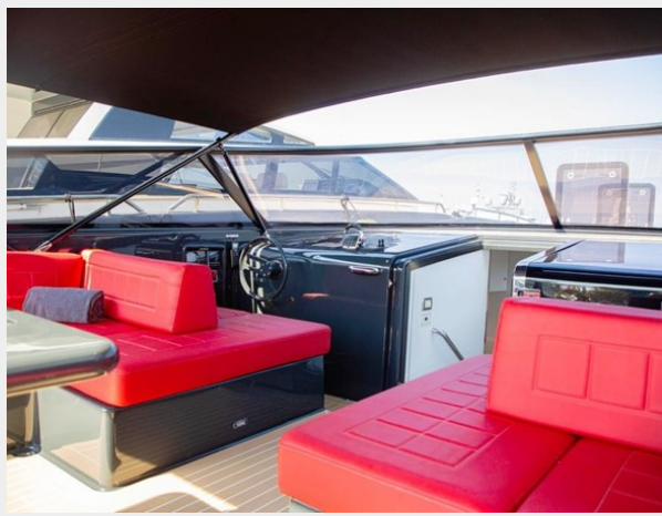
2013 VANDUCTCH 55_9.spec