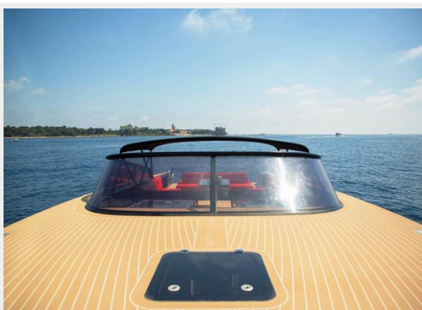
2013 VANDUCTCH 55_11.spec