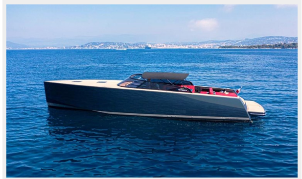
2013 VANDUCTCH 55_4.spec