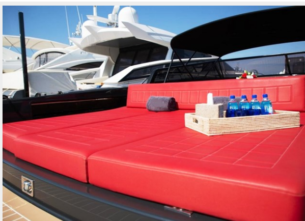
2013 VANDUCTCH 55_5.spec