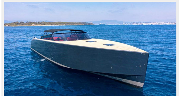
2013 VANDUCTCH 55_2.spec