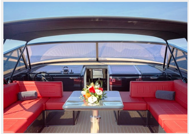
2013 VANDUCTCH 55_8.spec