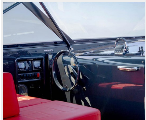
2013 VANDUCTCH 55_10.spec