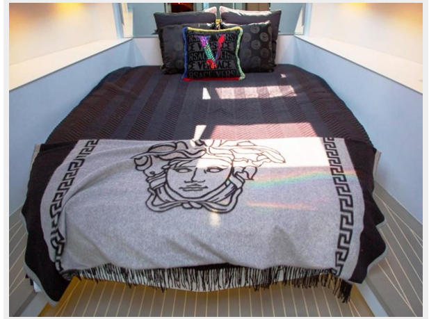
2013 VANDUCTCH 55_14.spec