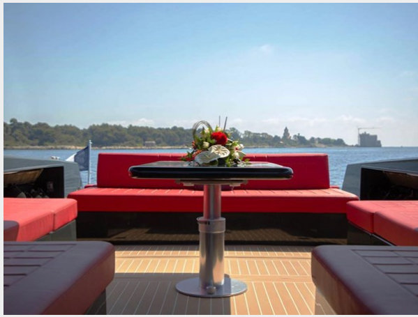
2013 VANDUCTCH 55_7.spec