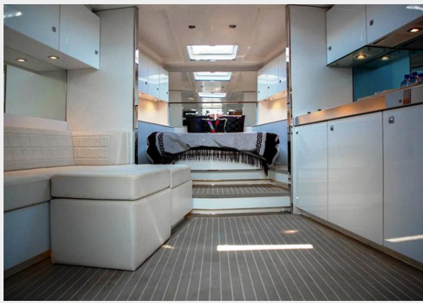
2013 VANDUCTCH 55_13.spec