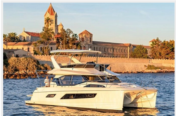
2020 Aquila 44 MY Power CATAMARAN - No Tan Lines 2020 Aquila 44 MY Power CATAMARAN - No Tan Lines