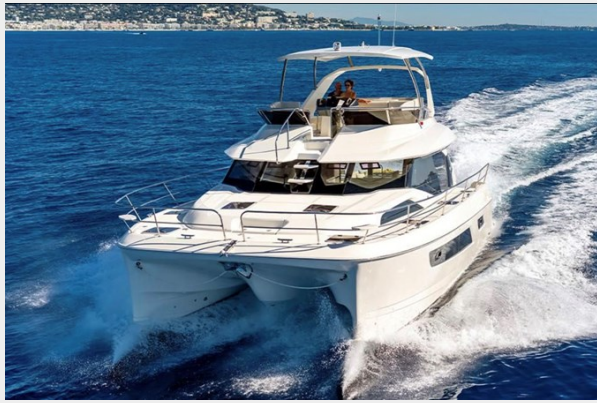
2020 Aquila 44 MY Power CATAMARAN - No Tan Lines 2020 Aquila 44 MY Power CATAMARAN - No Tan Lines