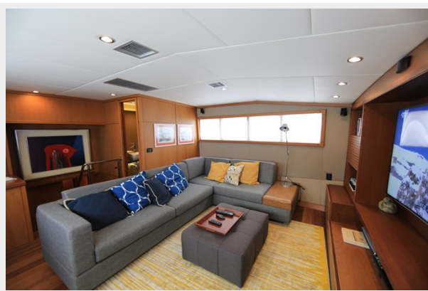
Main Deck - TV Lounge - port side view