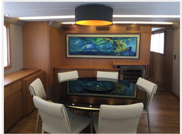
Main Salon - Dinner