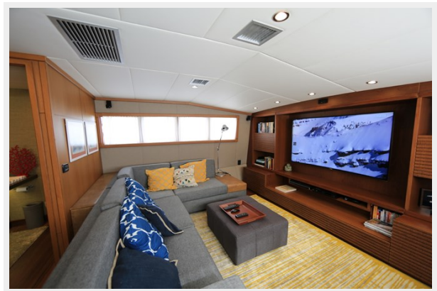
Main Deck - TV Lounge - fwd view wide