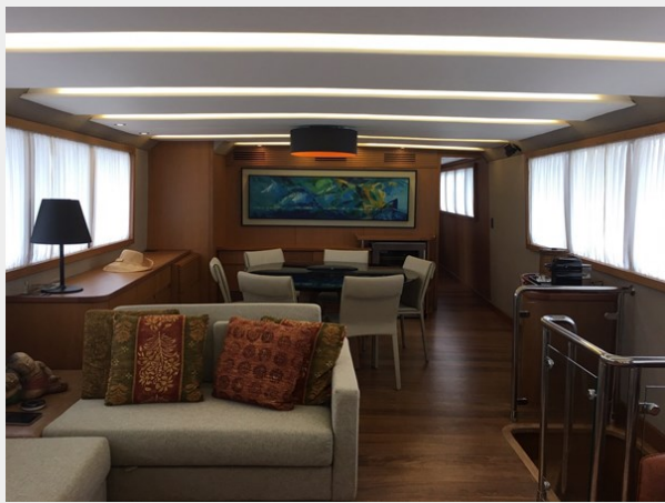
Main Salon - fwd view