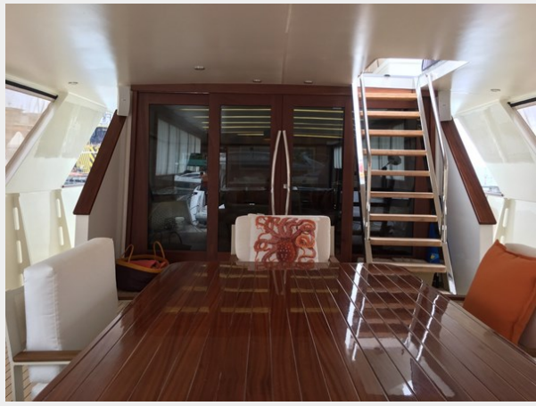
Main deck aft