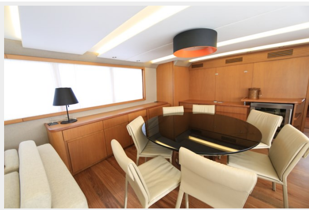
Main Salon - Dinner - sunlight