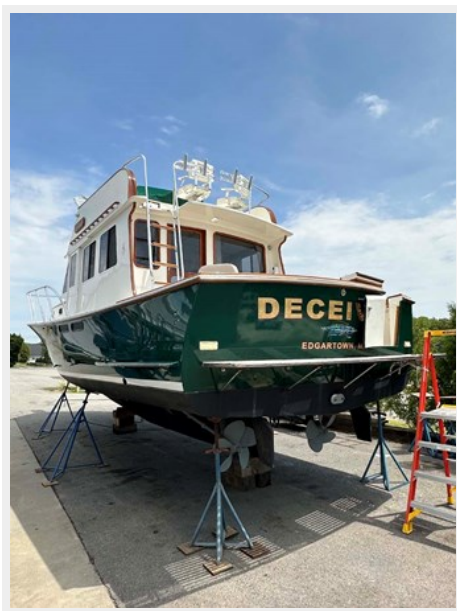
Port Quarter on the Hard