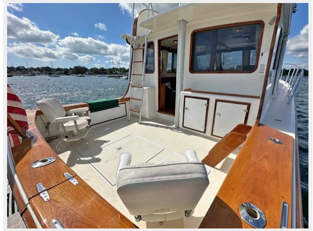
Cockpit Looking Forward