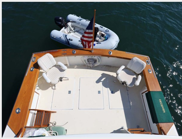
Cockpit from Above