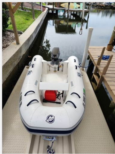
Petry's Pet tender web1