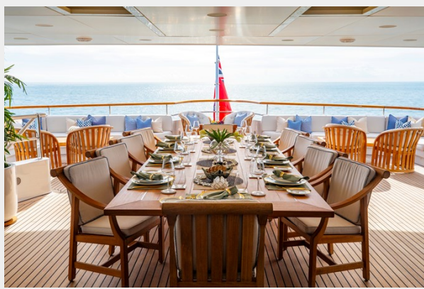
MiMi Aft Deck Dining