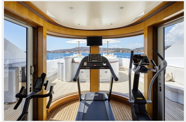
MiMi Enclosed Gym on Sundeck