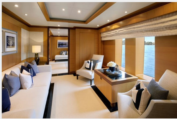
MiMi Master Suite Lounge