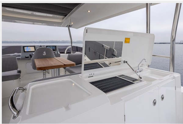
6.6 Swift 058 L