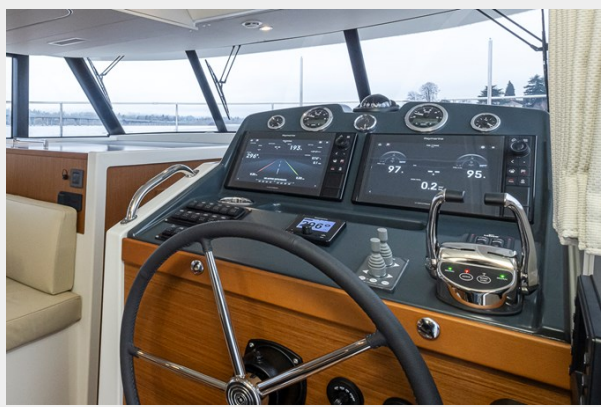
18 Swift 049 L