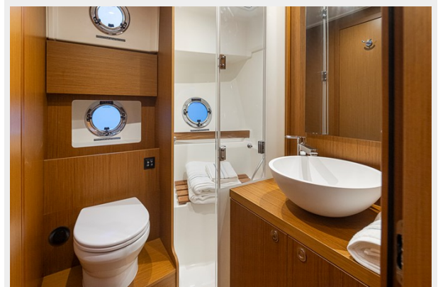
23 Swift 022 L