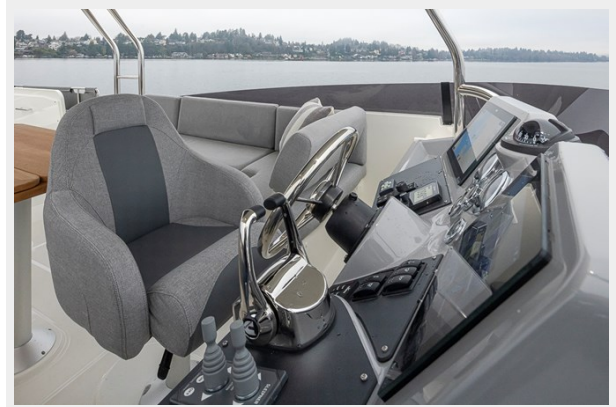
6.5 Swift 057 L