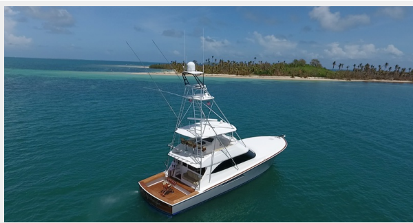
6_My Michelle 14