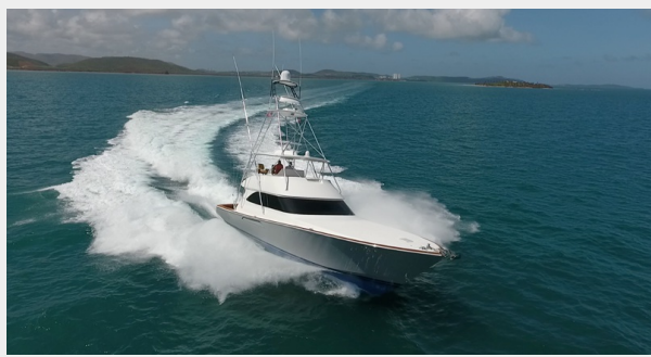
4_My Michelle 9