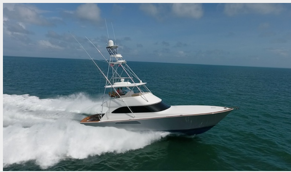
2_My Michelle 1