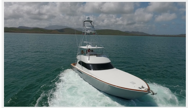
3_My Michelle 6