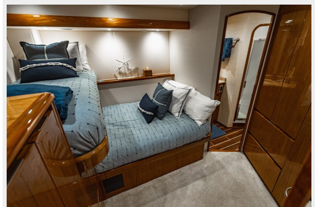
57 Port Guest