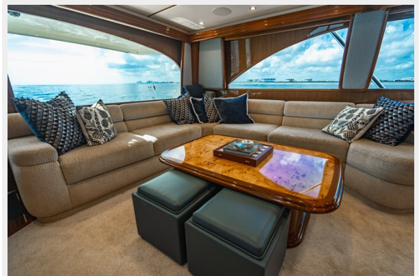
23 Salon 3