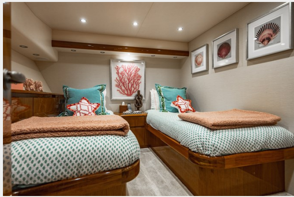
55 Starb Guest3