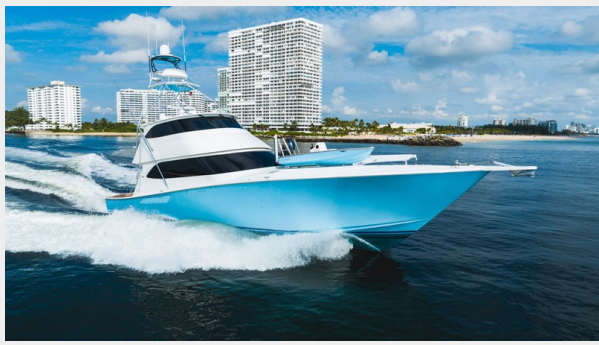
3. Ext profile