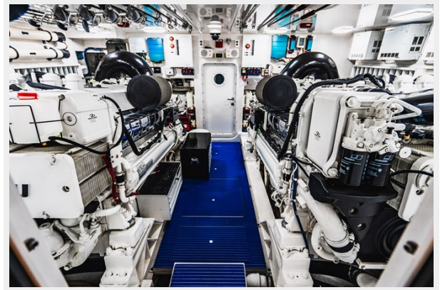
90 Engine Room