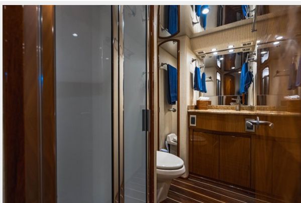
82 Captain Head