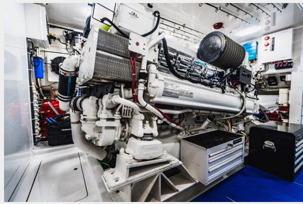
91 Engine room