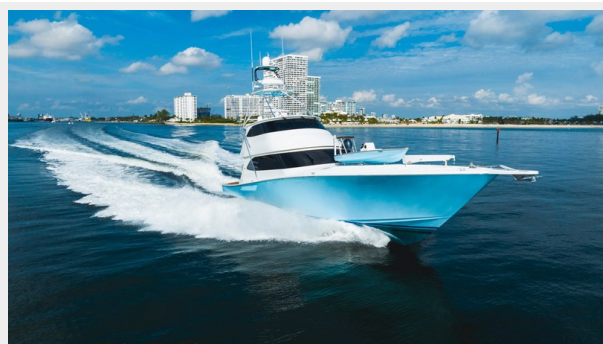
4. Ext profile