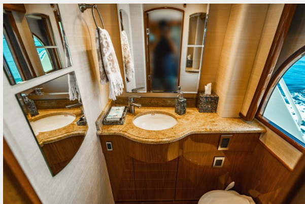
24 Salon Dayhead