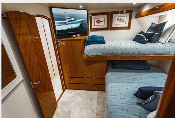
57 Port Guest2