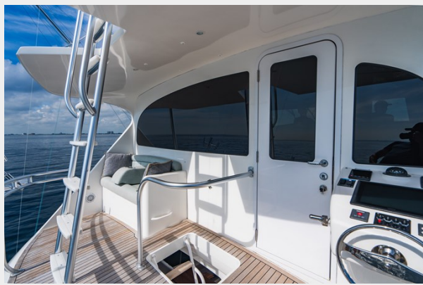
19. Aft EB