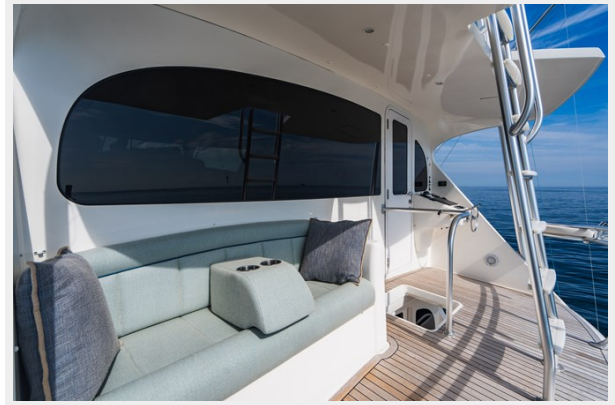
18 AFT EB