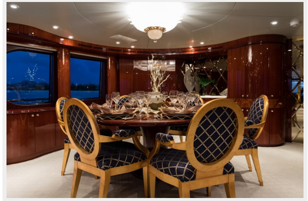
Dining - TOUCH