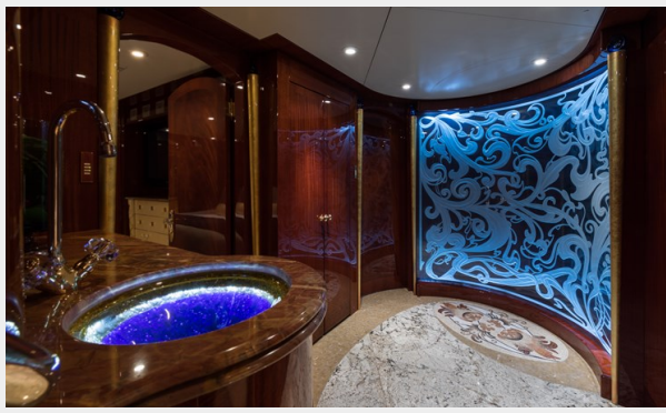
Lower deck foyer - TOUCH