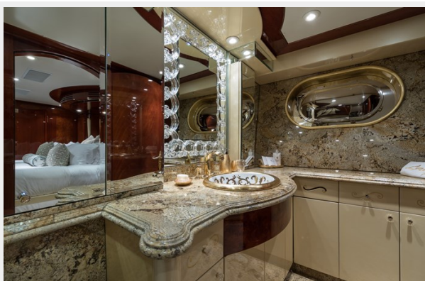
Guest 2 En-Suite - TOUCH