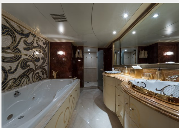
Master Stateroom En-Suite - TOUCH