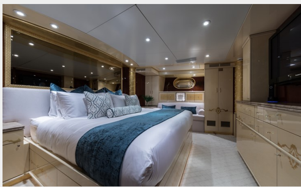
VIP - TOUCH