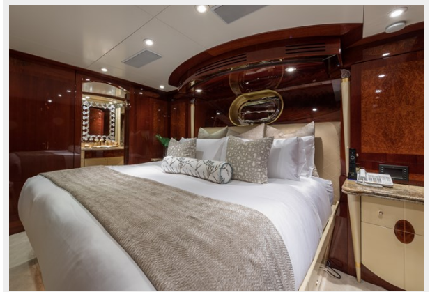
Guest 2 - TOUCH