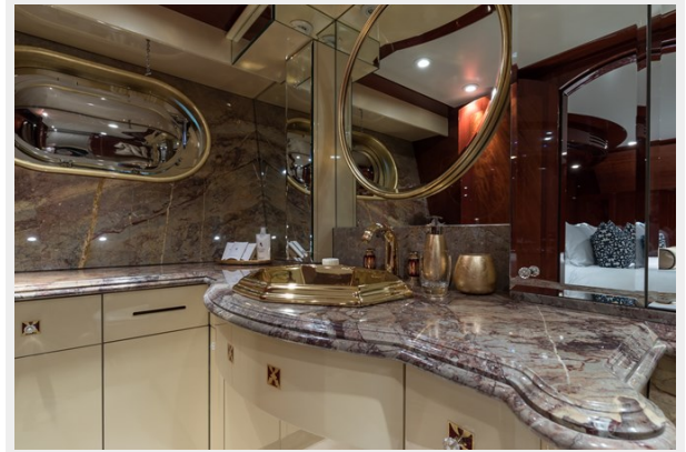
Guest 1 En-Suite - TOUCH