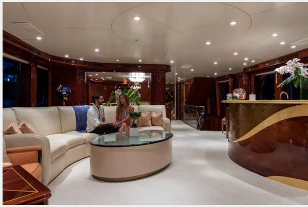
Main Salon - TOUCH