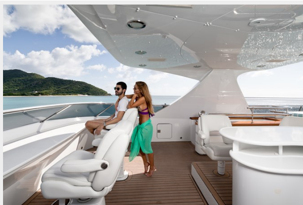
Sun Deck - TOUCH