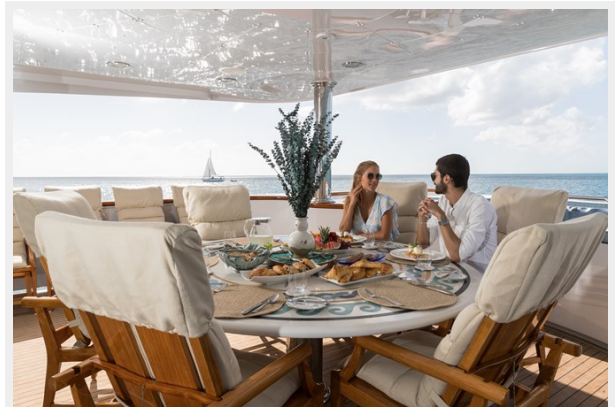
Main Deck Aft - TOUCH