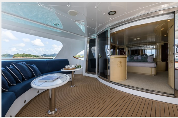
Owner's Deck Aft - TOUCH