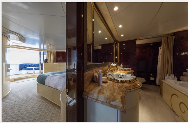
Master Stateroom - TOUCH