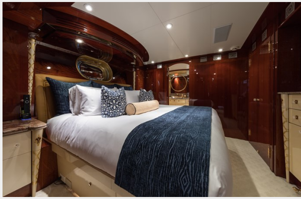
Guest 1 - TOUCH