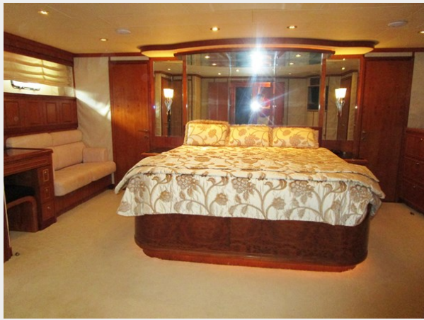
Master Looking Aft