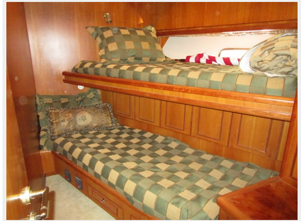
Stbd Side Crew