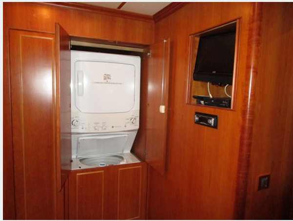
Crew Area Laundry