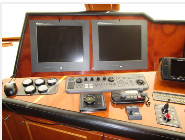
Helm Detail Starboard