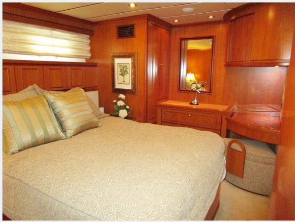
Port Side Guest Looking Forward