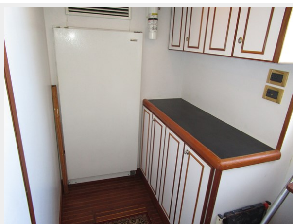
Lazarette to Stbd