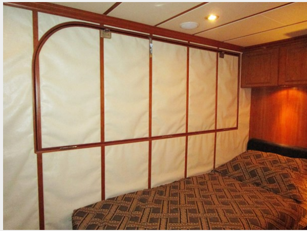
Stbd Side Cabin Pullman