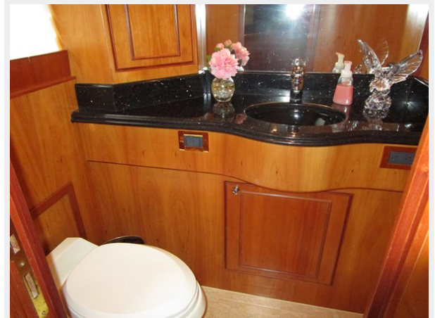
Main Deck Day Head