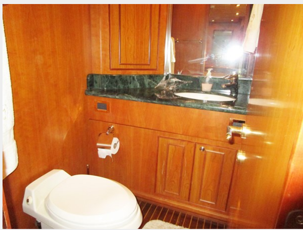
Port Side Guest Cabin Head