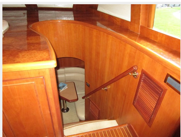
Crew Area Steps Aft Galley