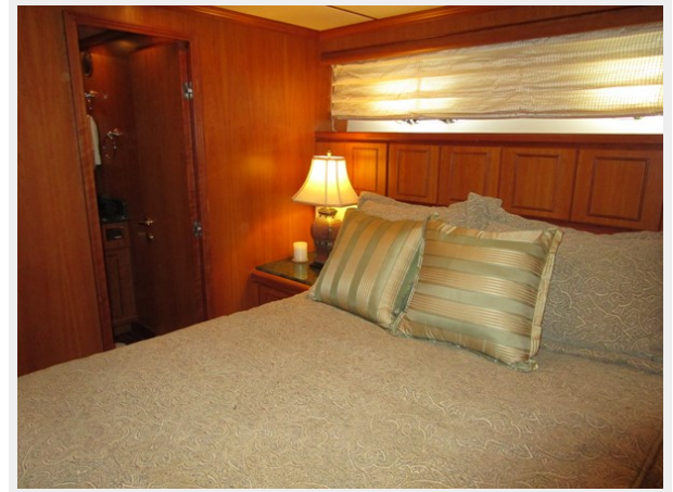
Port Side Guest Looking Aft