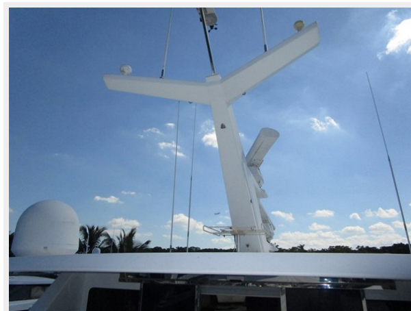
Coach Roof Equipment