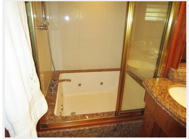
Master Tub Shower