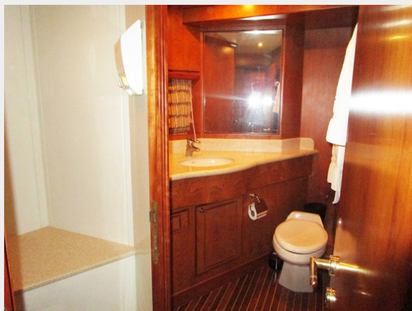
Port Side Crew Head