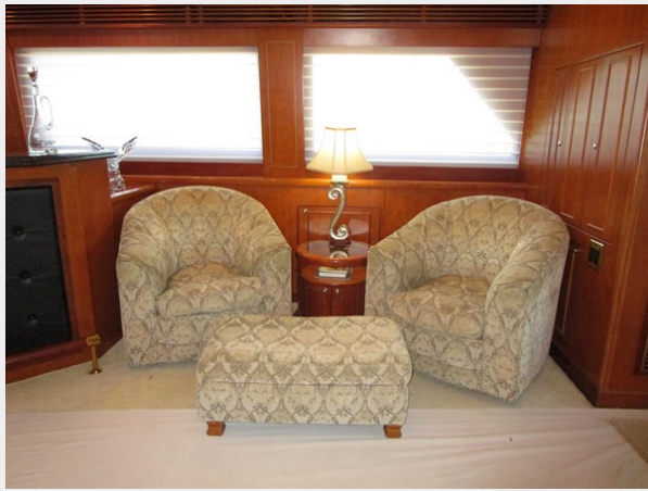
Salon to Stbd Aft