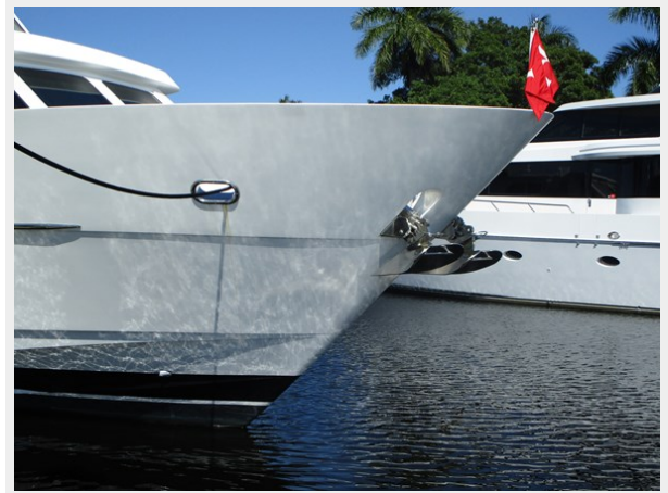
Twin Anchor Detail