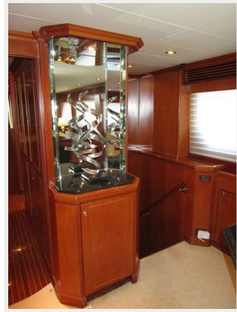
Salon to Stbd Forward