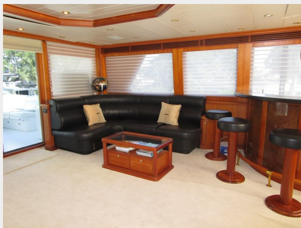
Skylounge to Port