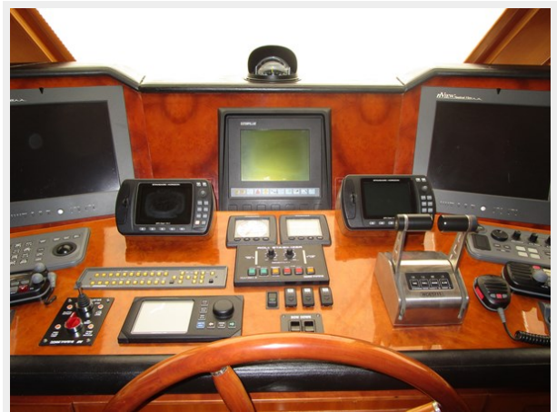
Helm Detail Center