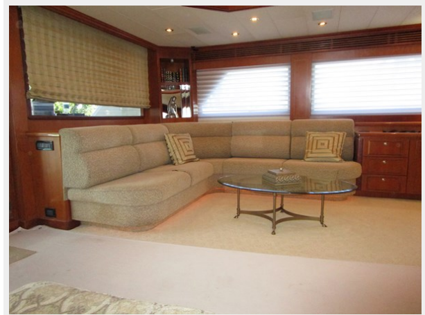
Salon to Port Aft