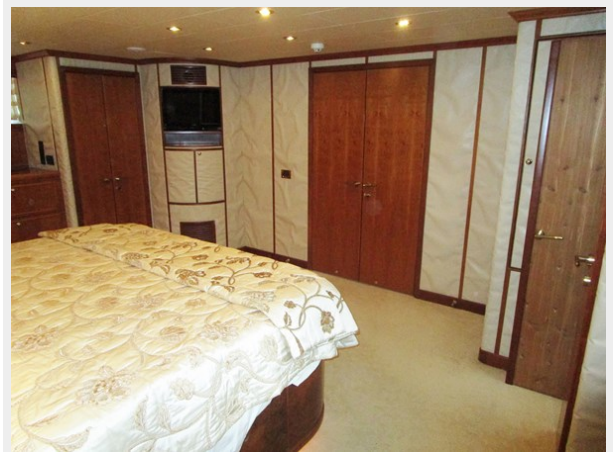
Master Port Forward