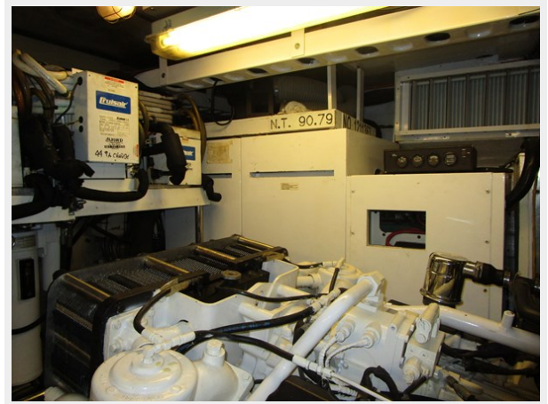
45 KW Generator