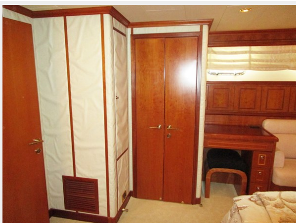
Master Starboard Forward