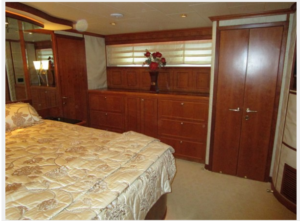
Master to Port