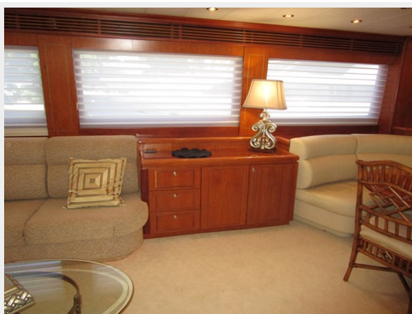
Salon to Port Middle