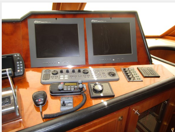
Helm Detail Port