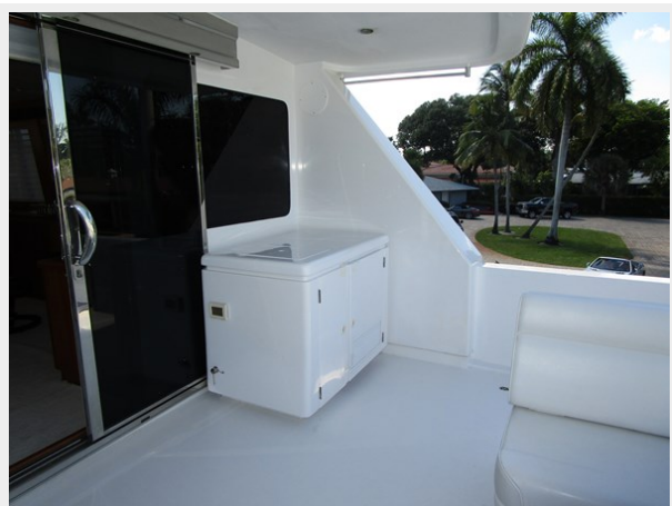
Boat Deck Storage