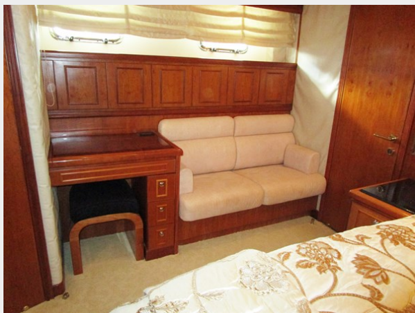
Master to Stbd