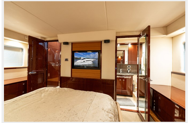
TV in the master stateroom