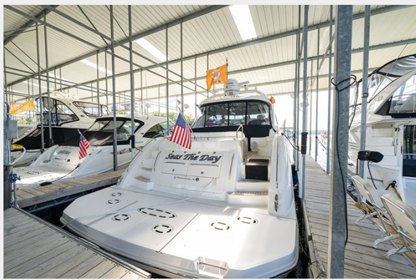
Stbd access to the cockpit