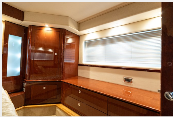
Storage in the master stateroom