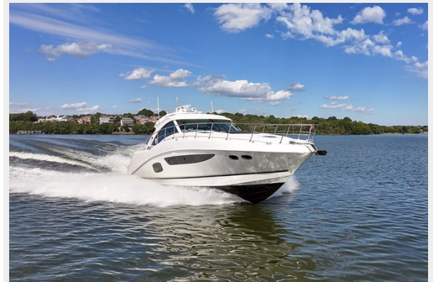
Stbd bow profile