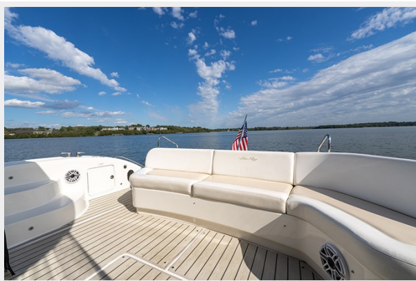
Cockpit - aft stbd corner