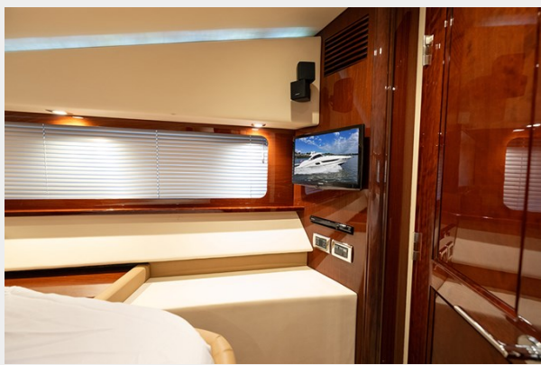
TV in the fwd stateroom