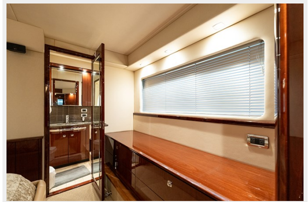
Entry to the master head