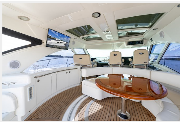
Cockpit looking forward