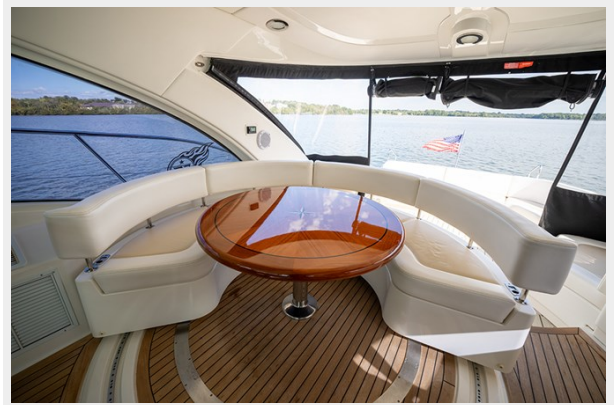
Cockpit table with the multi-position carousel seating