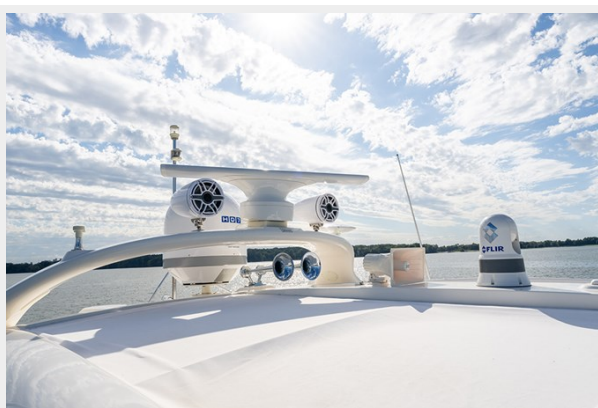
KVH Tracvision HD7