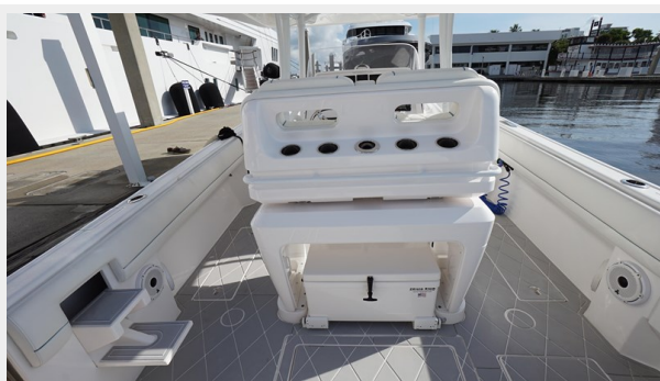
Intrepid 40' 2021 Aft Deck