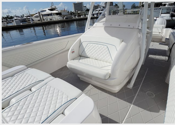
Intrepid 40' 2021 ' Bow Lounge