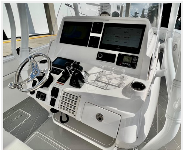
Intrepid 40' 2021 Helm