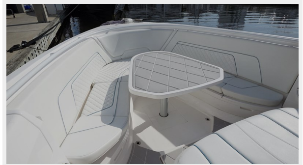
Intrepid 40' 2021 Bow Lounge