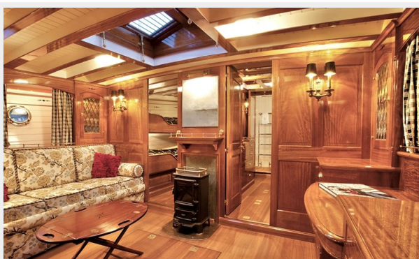
Main Saloon with fireplace