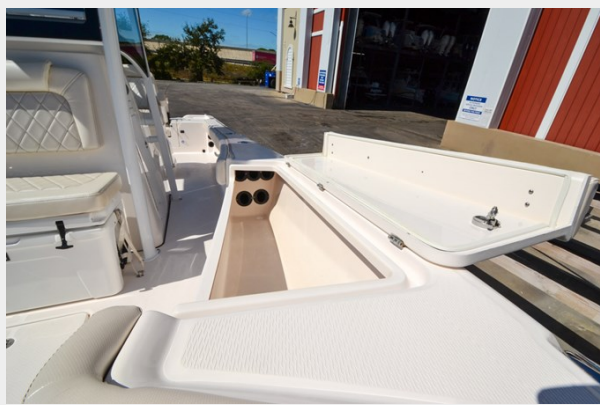
2021 Blue Wave 2800 Makira 17