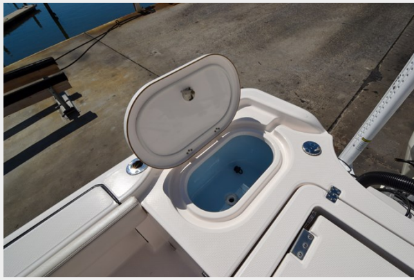
2021 Blue Wave 2800 Makira 37