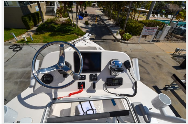
2021 Blue Wave 2800 Makira 32