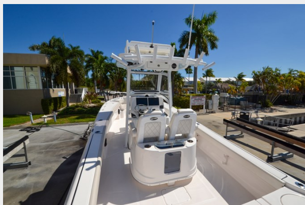
2021 Blue Wave 2800 Makira 11