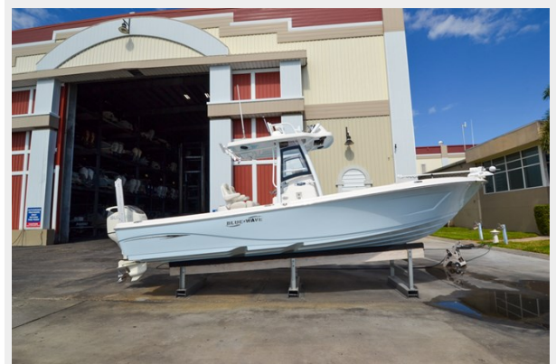
2021 Blue Wave 2800 Makira 58