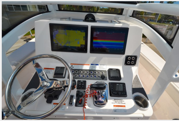
2021 Blue Wave 2800 Makira 13