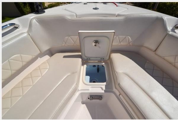
2021 Blue Wave 2800 Makira 21