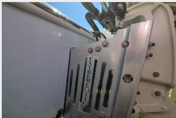
2021 Blue Wave 2800 Makira 9