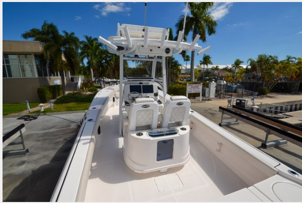
2021 Blue Wave 2800 Makira 55