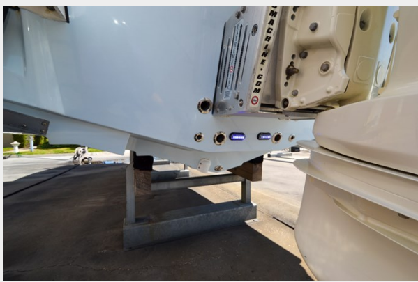
2021 Blue Wave 2800 Makira 41