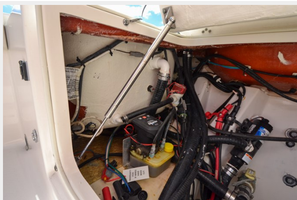
2021 Blue Wave 2800 Makira 53