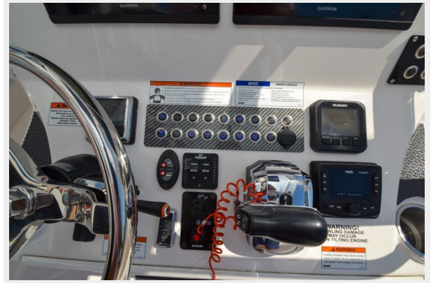
2021 Blue Wave 2800 Makira 14