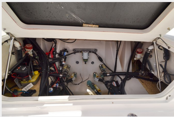
2021 Blue Wave 2800 Makira 51