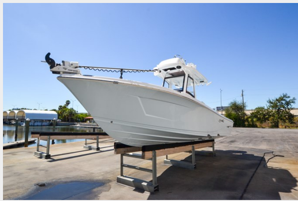
2021 Blue Wave 2800 Makira 1