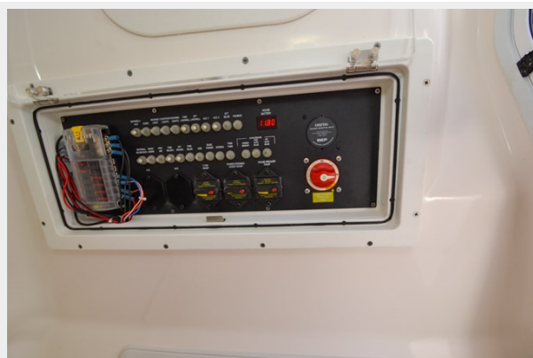
2021 Blue Wave 2800 Makira 29