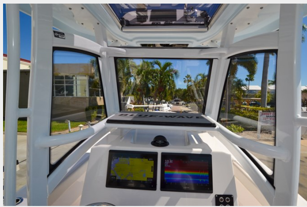
2021 Blue Wave 2800 Makira 15