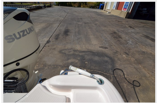
2021 Blue Wave 2800 Makira 40