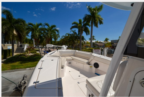
2021 Blue Wave 2800 Makira 47