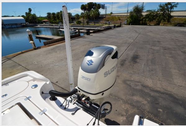
2021 Blue Wave 2800 Makira 39