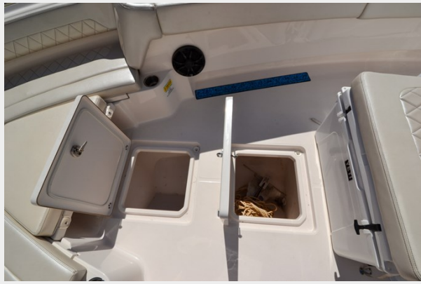
2021 Blue Wave 2800 Makira 19