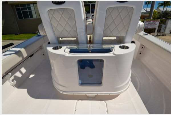
2021 Blue Wave 2800 Makira 43