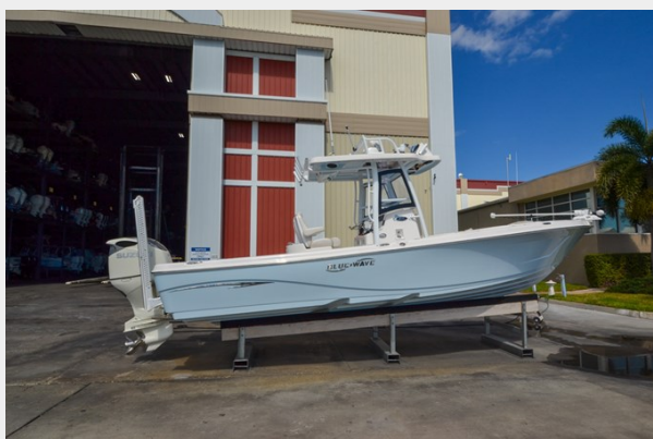
2021 Blue Wave 2800 Makira 57