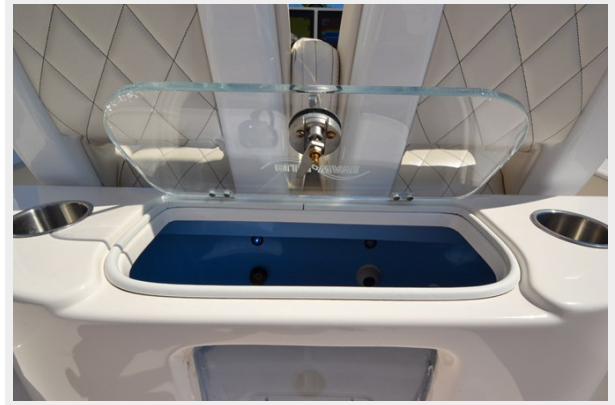
2021 Blue Wave 2800 Makira 44