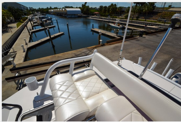
2021 Blue Wave 2800 Makira 33