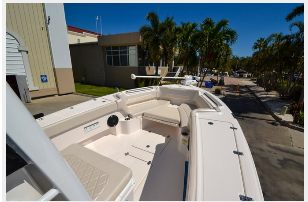
2021 Blue Wave 2800 Makira 16