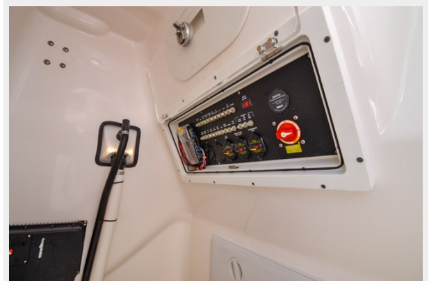
2021 Blue Wave 2800 Makira 28