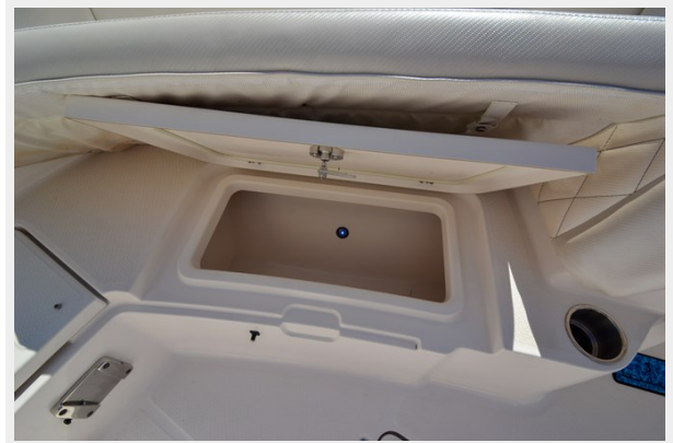
2021 Blue Wave 2800 Makira 22