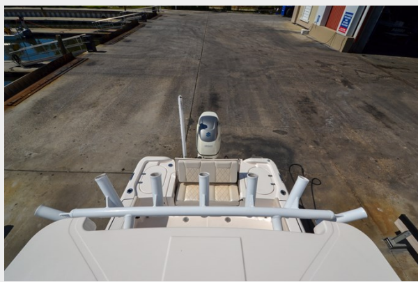
2021 Blue Wave 2800 Makira 35