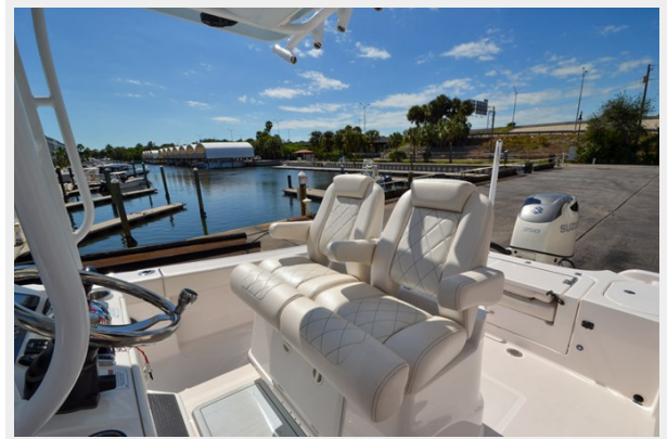
2021 Blue Wave 2800 Makira 46