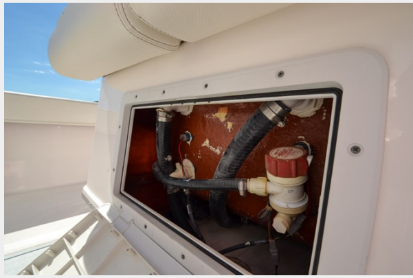
2021 Blue Wave 2800 Makira 49