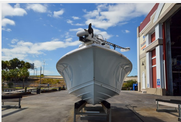
2021 Blue Wave 2800 Makira 59