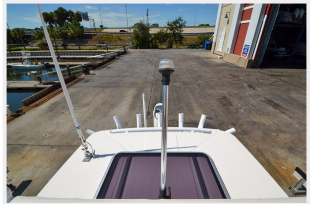
2021 Blue Wave 2800 Makira 34