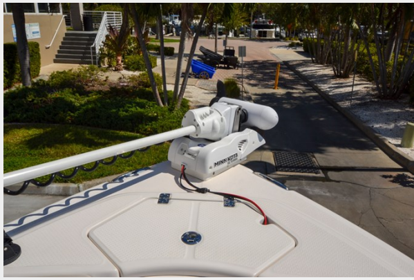
2021 Blue Wave 2800 Makira 25