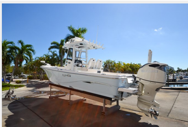
2021 Blue Wave 2800 Makira 3