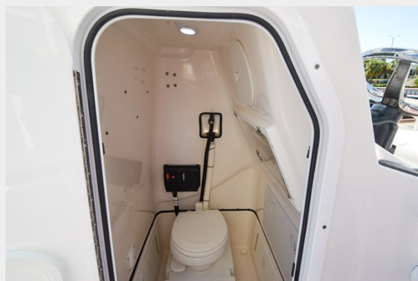
2021 Blue Wave 2800 Makira 27