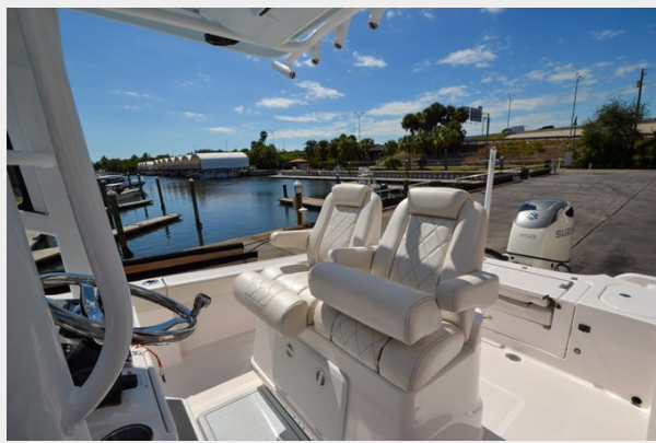
2021 Blue Wave 2800 Makira 45