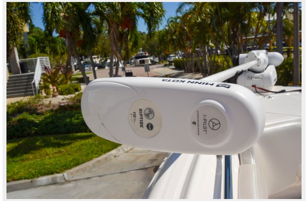
2021 Blue Wave 2800 Makira 26