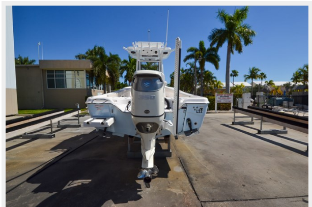
2021 Blue Wave 2800 Makira 4