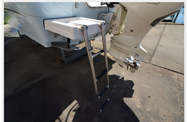
2021 Blue Wave 2800 Makira 10