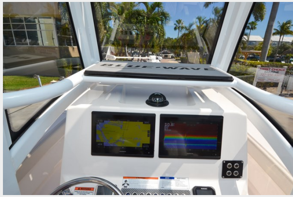
2021 Blue Wave 2800 Makira 31