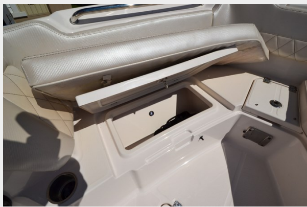
2021 Blue Wave 2800 Makira 23