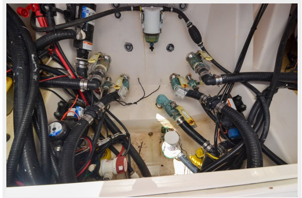
2021 Blue Wave 2800 Makira 52