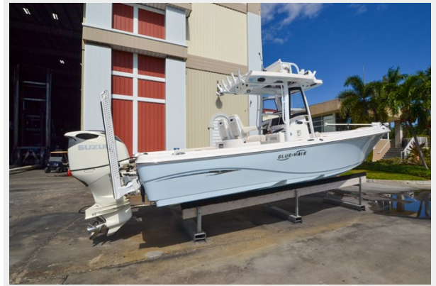
2021 Blue Wave 2800 Makira 56