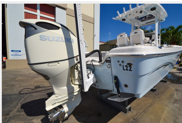
2021 Blue Wave 2800 Makira 5