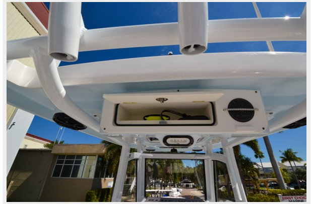
2021 Blue Wave 2800 Makira 50