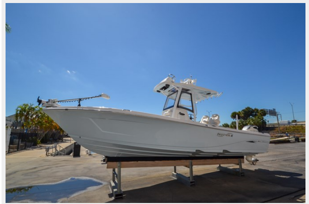
2021 Blue Wave 2800 Makira 2