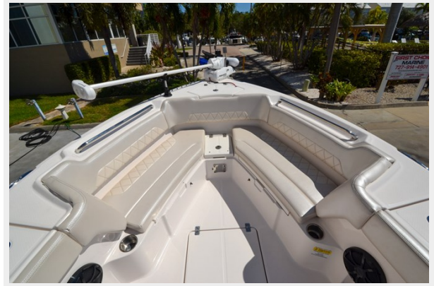
2021 Blue Wave 2800 Makira 20