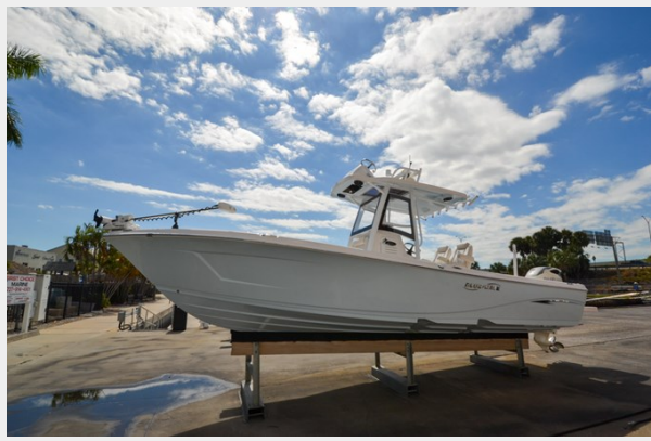
2021 Blue Wave 2800 Makira 61