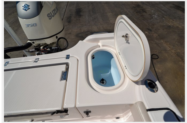
2021 Blue Wave 2800 Makira 38