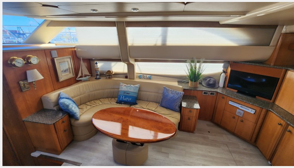
Salon Stb Side/Dinnette