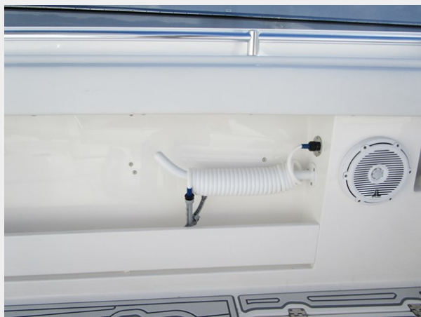
One of 4 Washdown Hoses