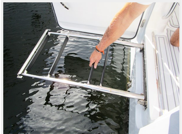
Dive Door Ladder