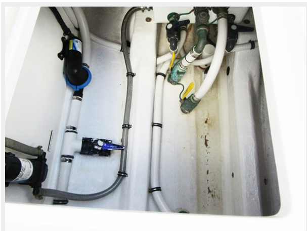
Pumps Under Deck