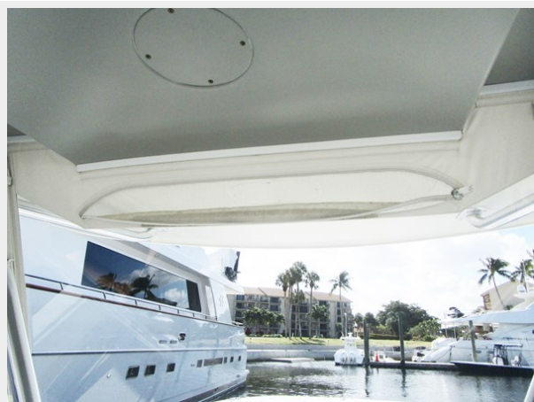
Vent Over Front Enclosure