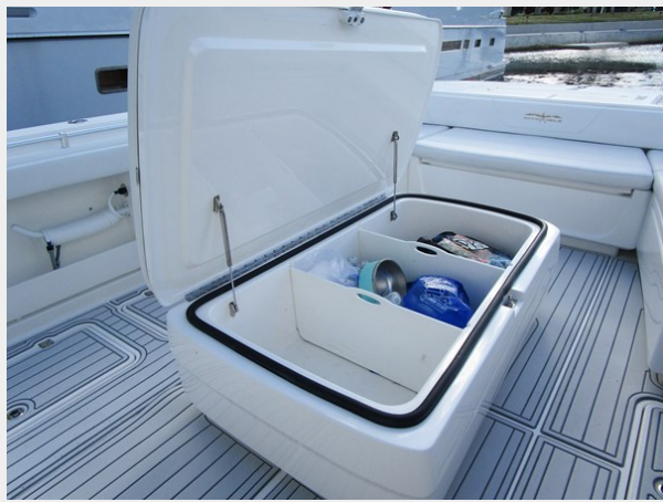
Coffin Box Storage