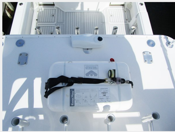
Tower View Aft