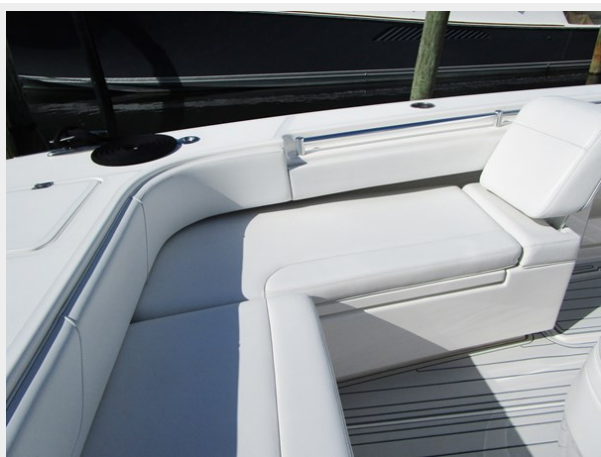
Stbd. Side Bow Seat