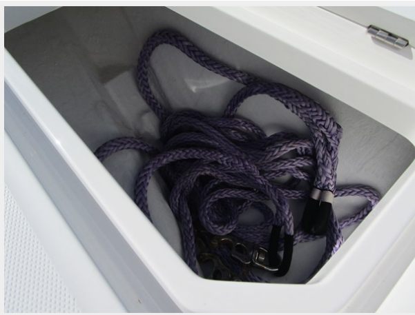
Stbd. Bow Hatch with Tow Bridle