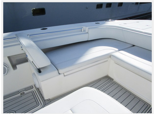
Port Side Bow Seat