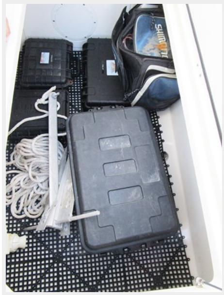
Under Deck Storage