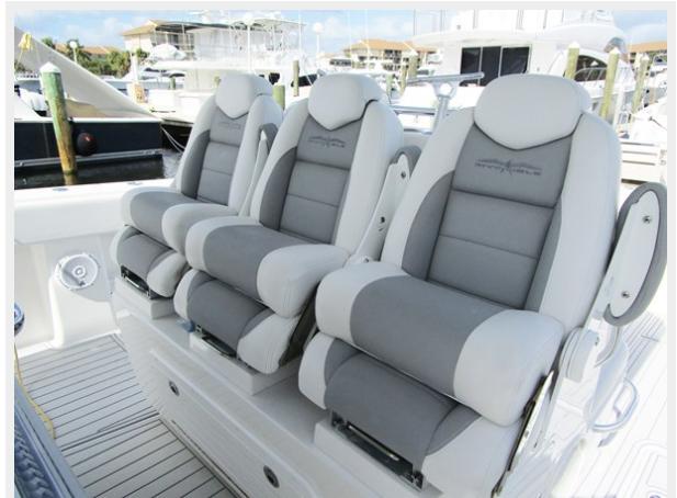
Llebroc Helm Seats