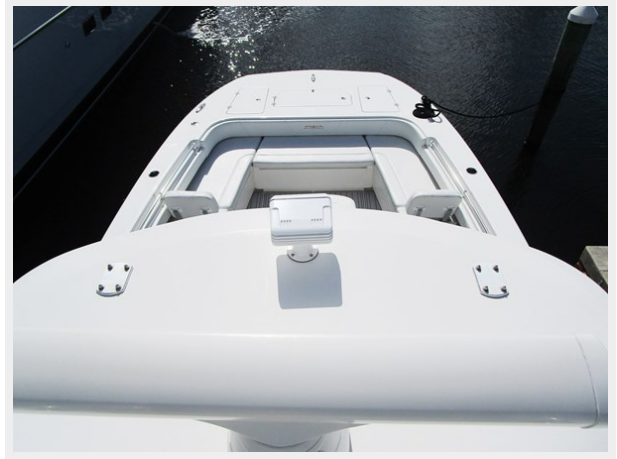
Tower View Forward