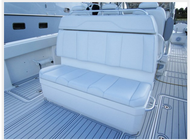
Aft Console Seat