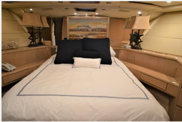
Seaquest_92 VIP Stateroom