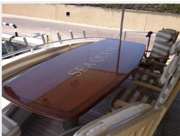
Seaquest_92 Aft Deck Dining