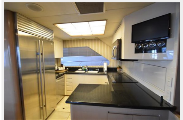
Seaquest_92 Main Deck Galley