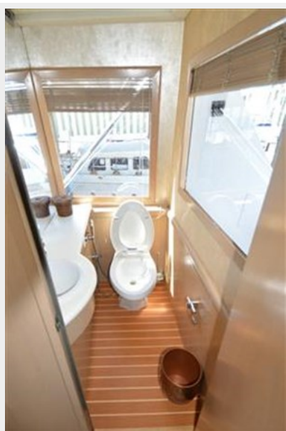
Seaquest_92 Upper Deck Day Head