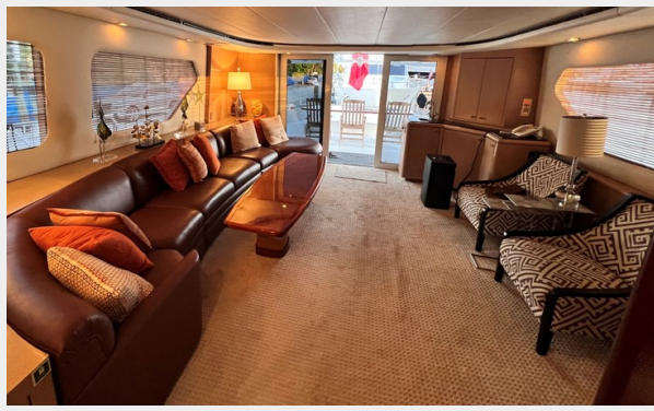
Seaquest_92 Main Deck Salon