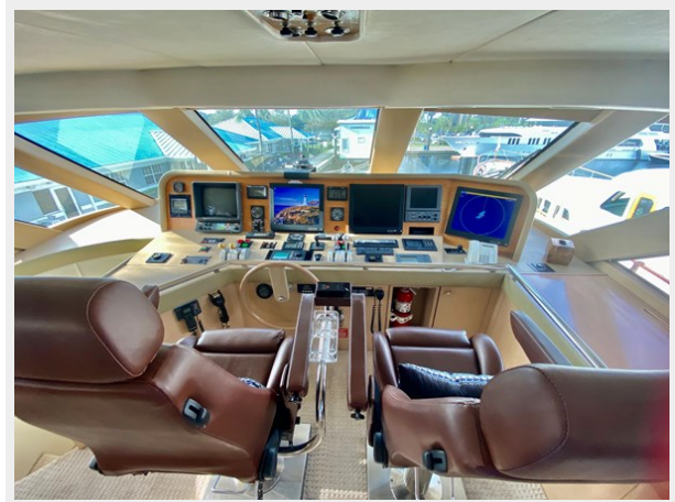
Seaquest_92 Upper Deck Skylounge Helm