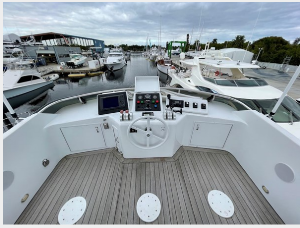
Seaquest_92 Flybridge Helm