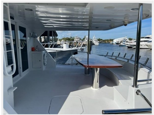
Seaquest_92 Aft Deck