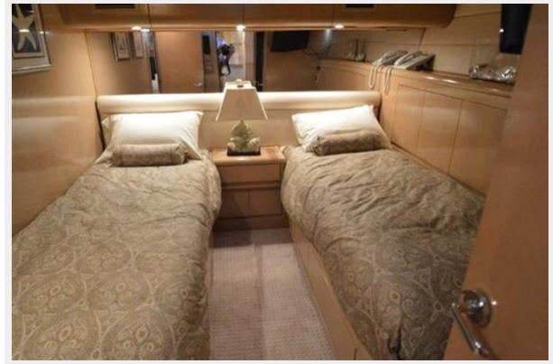
Seaquest_92 Guest Stateroom