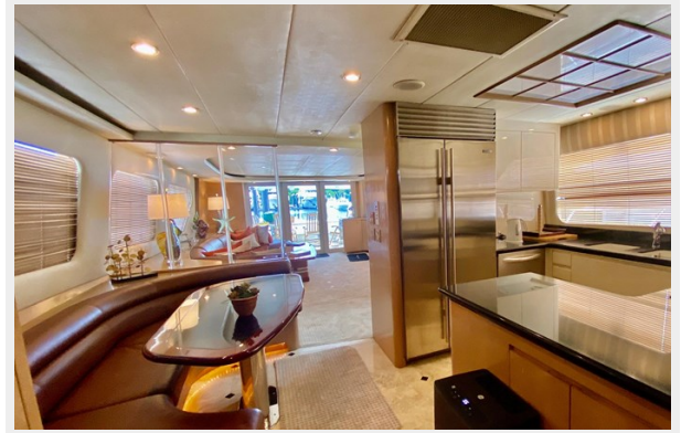
Seaquest_92 Main Deck Dining and Galley