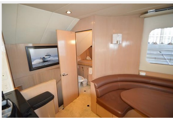
Seaquest_92 Main Deck Day Head