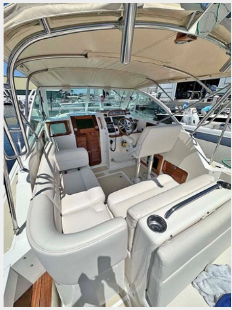
Looking Fwd from Cockpit