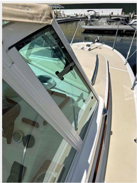
Looking Fwd from Stbd. Deck