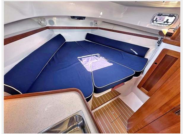
V-Berth w Filler