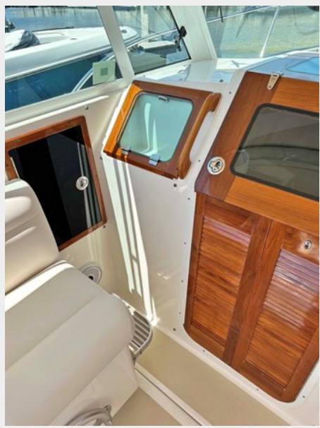
Teak Glove Box and Companionway