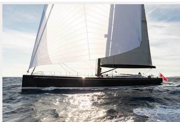
Sailing Yacht SHAMANNA 3