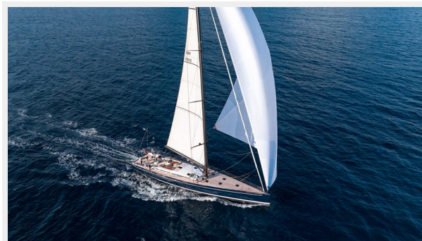
Sailing Yacht SHAMANNA 2