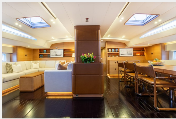
Sailing Yacht SHAMANNA - Main salon 1