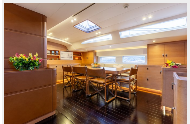
Sailing Yacht SHAMANNA - Main salon 4