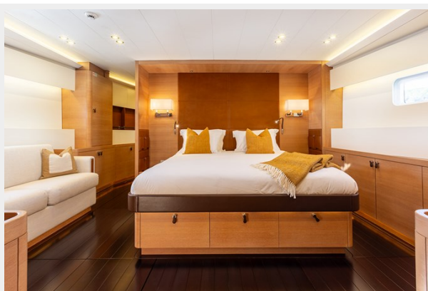
Sailing Yacht SHAMANNA - Master Cabin 1