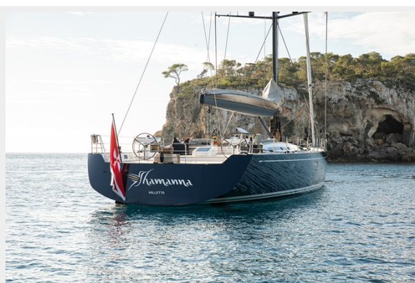
Sailing Yacht SHAMANNA 5