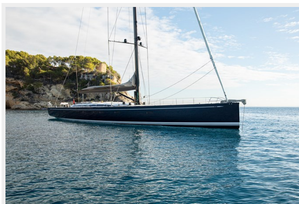
Sailing Yacht SHAMANNA 4