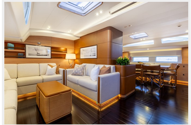
Sailing Yacht SHAMANNA - Main salon 2