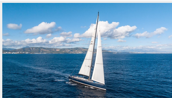
Sailing Yacht SHAMANNA 1