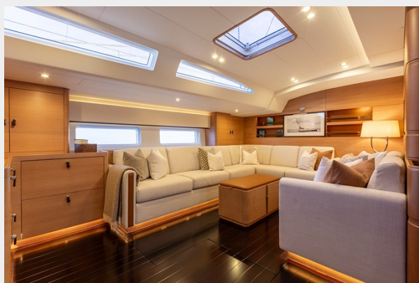
Sailing Yacht SHAMANNA - Main salon 3