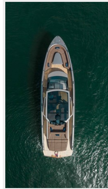
ELLAMIA Aerials Web Res-7