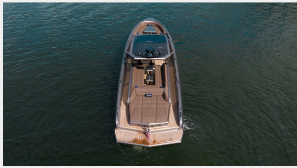
ELLAMIA Aerials Web Res