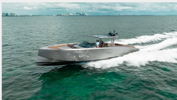
ELLAMIA Aerials Web Res-17