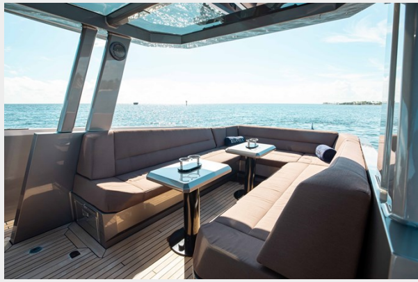
ELLAMIA Interiors Web Res-16