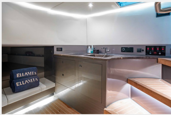
ELLAMIA Interiors Web Res-3