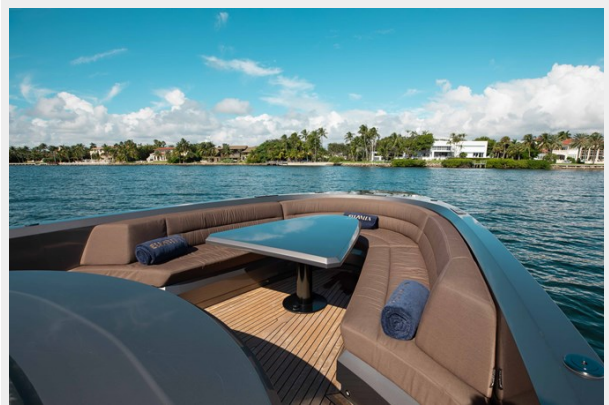
ELLAMIA Interiors Web Res-9