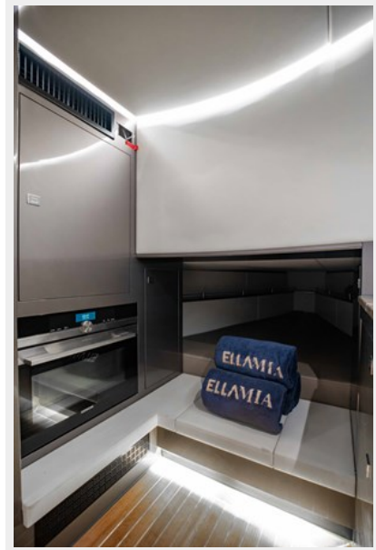
ELLAMIA Interiors Web Res-4