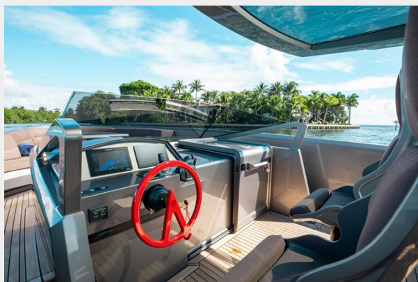
ELLAMIA Interiors Web Res-12