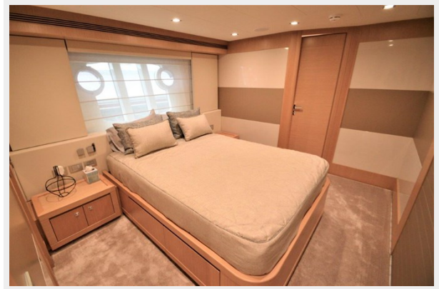
Guest Stateroom - Stbd.