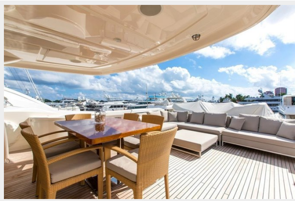
Bridge Aft Deck