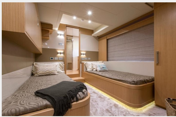
Twin Stateroom with pullman - Stbd