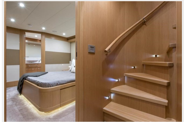
Stairway to main deck