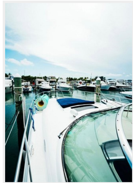
420 SEA RAY 2003 BOW