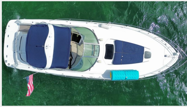
420 SEA RAY 2003 ARIEL VIEW