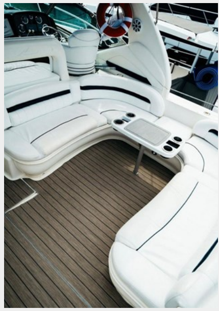
420 SEA RAY 2003 COCKPIT