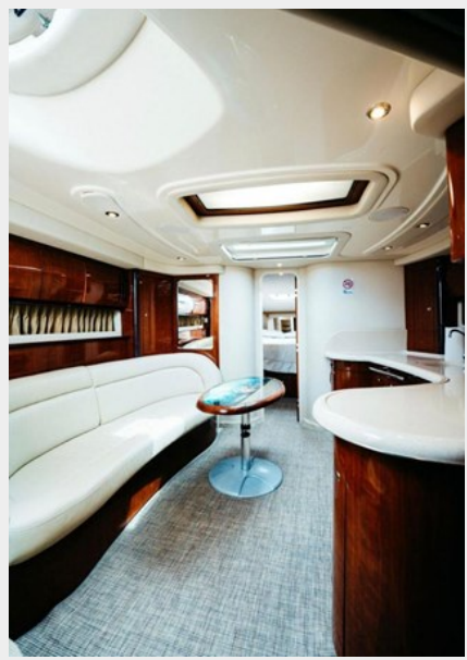
420 SEA RAY 2003 SALON