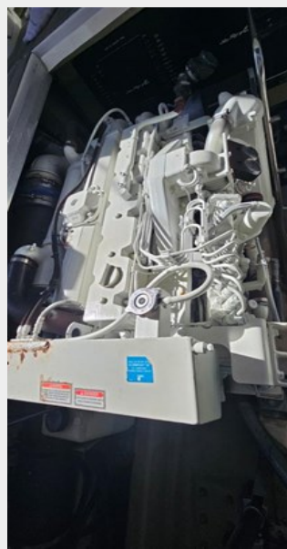
420 SEA RAY 2003 ENGINES 2