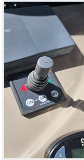
420 SEA RAY 2003 THRUSTER CONTROL