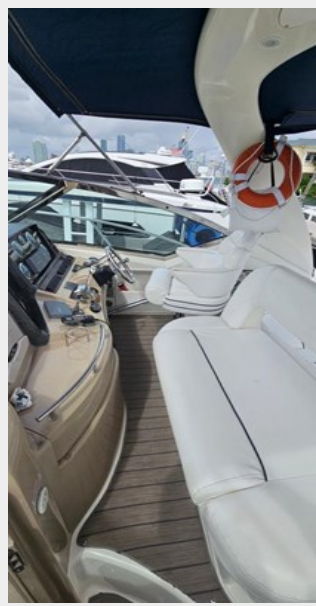
420 SEA RAY 2003 HELM AREA