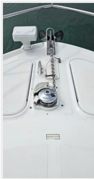
420 SEA RAY 2003 WINDLESS