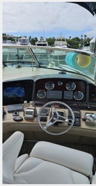
420 SEA RAY 2003 HELM