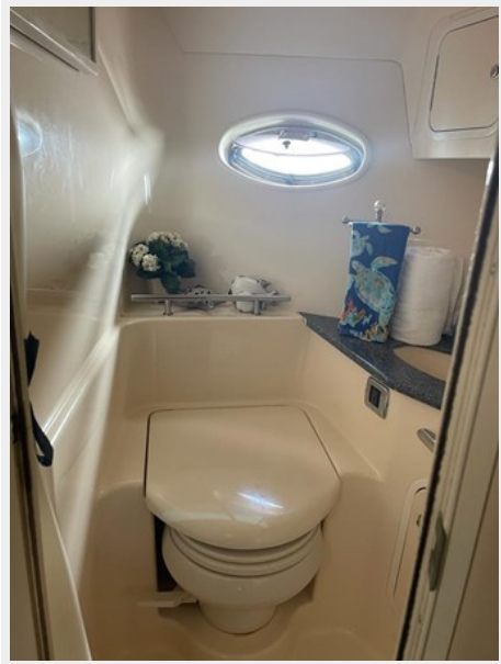
420 SEA RAY 2003 HEAD 2