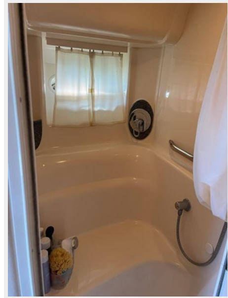
420 SEA RAY 2003 HEAD 3