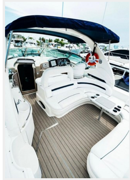
420 SEA RAY 2003 COCKPIT 2