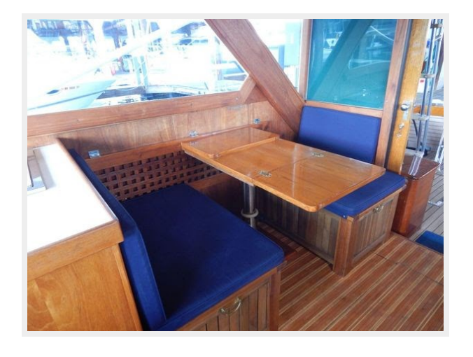
Post 38 Sportfish - Salon Table