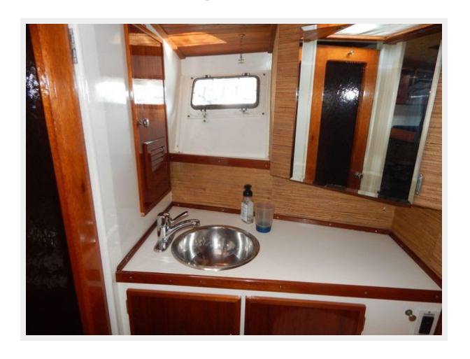
Post 38 Sportfish - Head