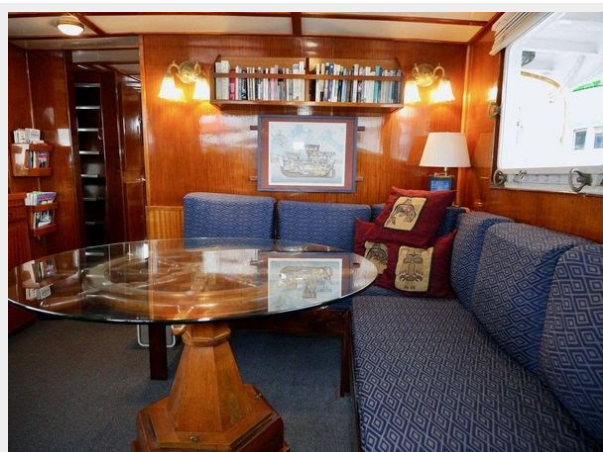
Southern Marine Malahide Trawler - Salon Table