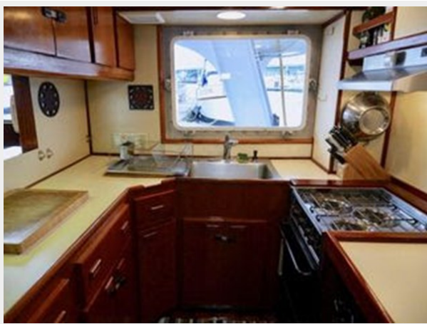
Southern Marine Malahide Trawler - Galley