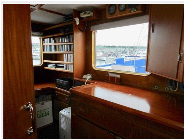
Southern Marine Malahide Trawler - Pilothouse