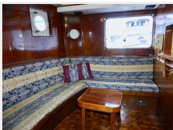
Southern Marine Malahide Trawler - Forward Salon