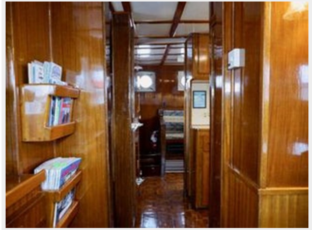
Southern Marine Malahide Trawler - Looking Aft