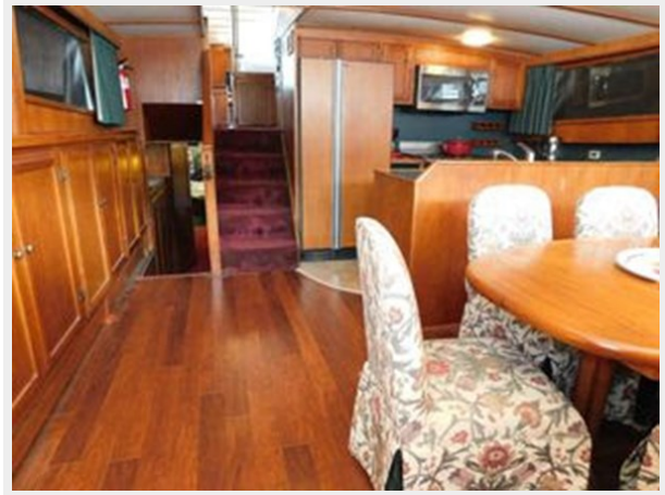
Monk-McQueen 74 Motoryacht - Looking Aft Interior