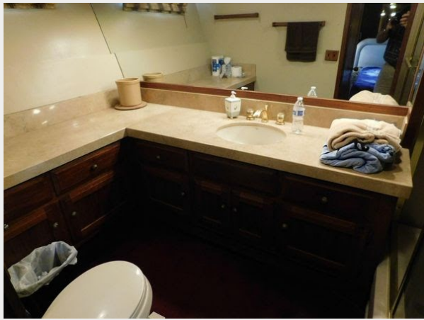
Monk-McQueen 74 Motoryacht - Head