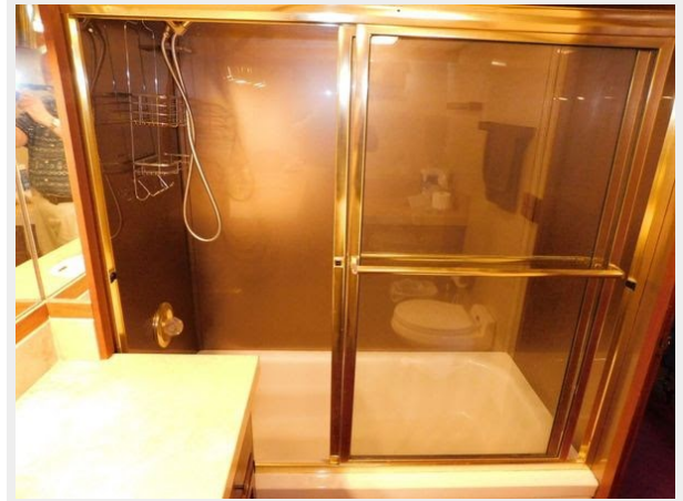
Monk-McQueen 74 Motoryacht - Shower