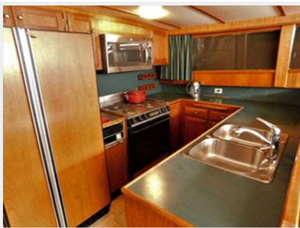
Monk-McQueen 74 Motoryacht - Galley