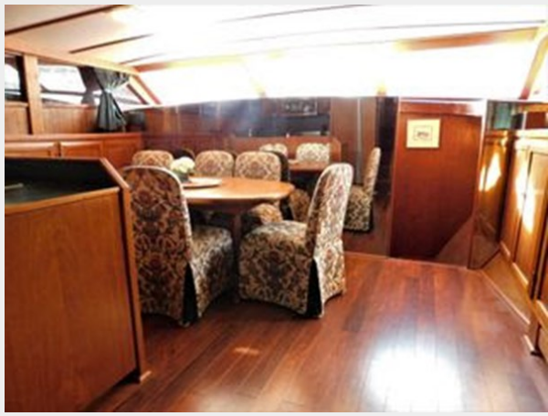
Monk-McQueen 74 Motoryacht - Looking Forward Interior