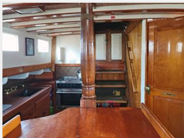
Gaff Rigged 61 Topsail Schooner - Looking Forward