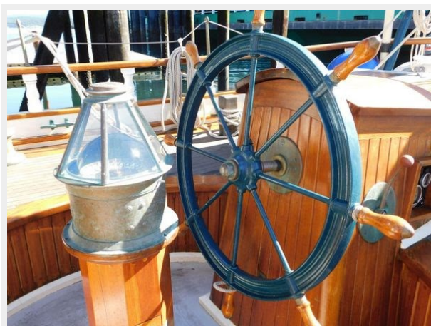
Gaff Rigged 61 Topsail Schooner - Helm