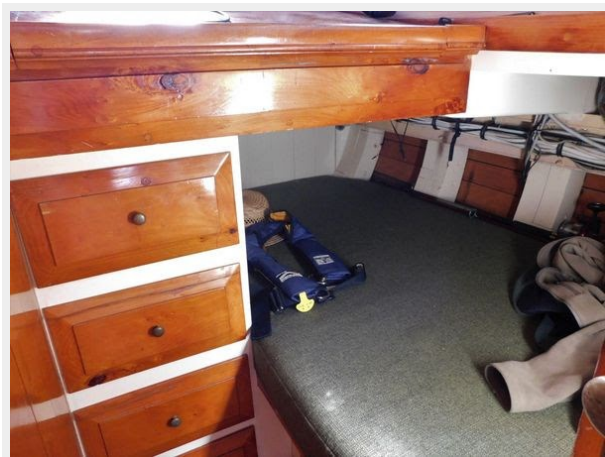
Gaff Rigged 61 Topsail Schooner - Aft Cabin