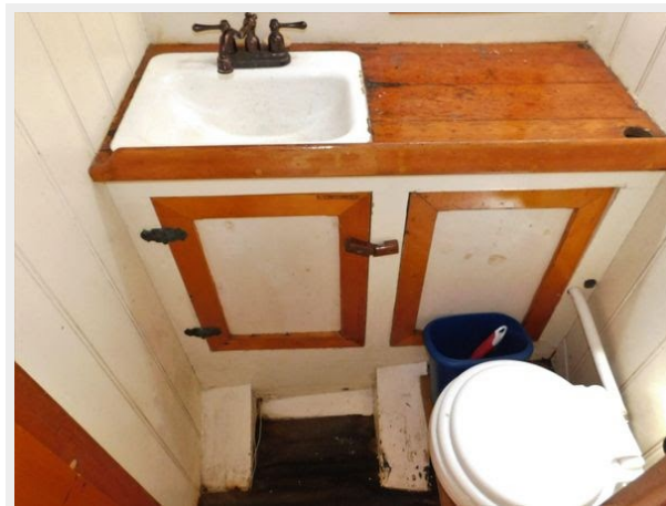
Gaff Rigged 61 Topsail Schooner - Head