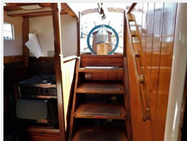
Gaff Rigged 61 Topsail Schooner - Looking Aft