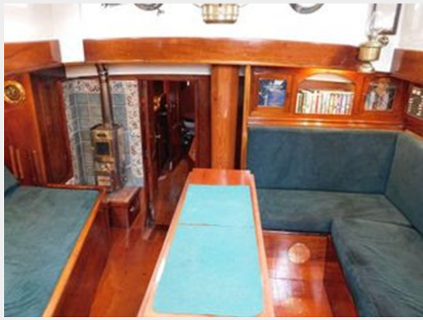
Murray Peterson Gaff Schooner Coaster III - Looking Forward