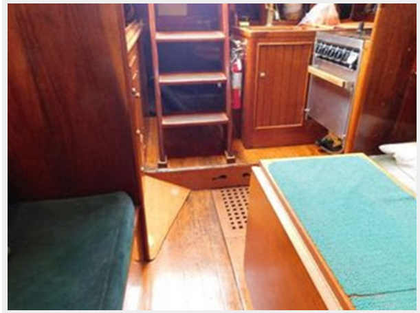
Murray Peterson Gaff Schooner Coaster III - Looking Aft