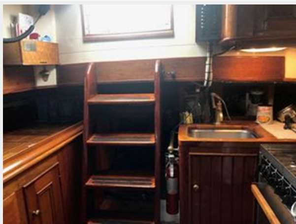
Murray Peterson Gaff Schooner Coaster III - Galley