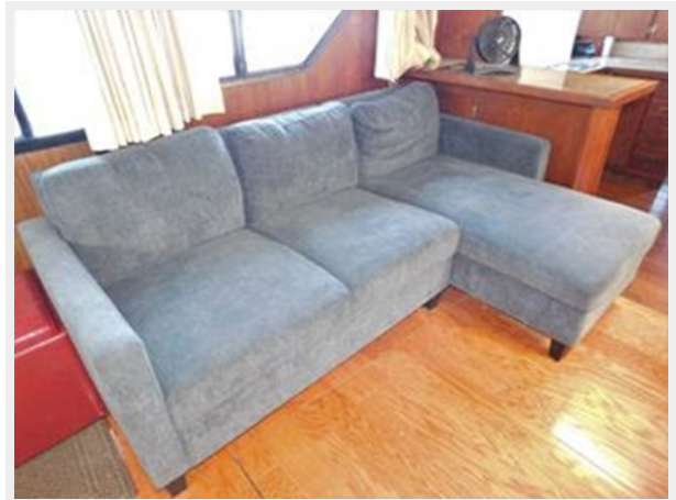
Bluewater 51 Coastal Cruiser - Salon