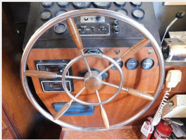
Bluewater 51 Coastal Cruiser - Helm