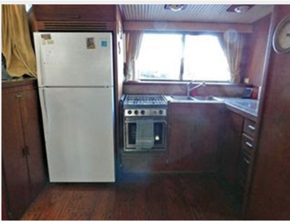
Bluewater 51 Coastal Cruiser - Galley