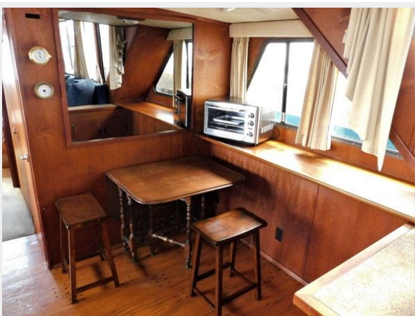
Bluewater 51 Coastal Cruiser - Salon Table