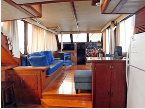
Bluewater 51 Coastal Cruiser - Looking Forward