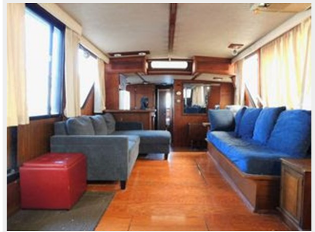
Bluewater 51 Coastal Cruiser - Looking Aft