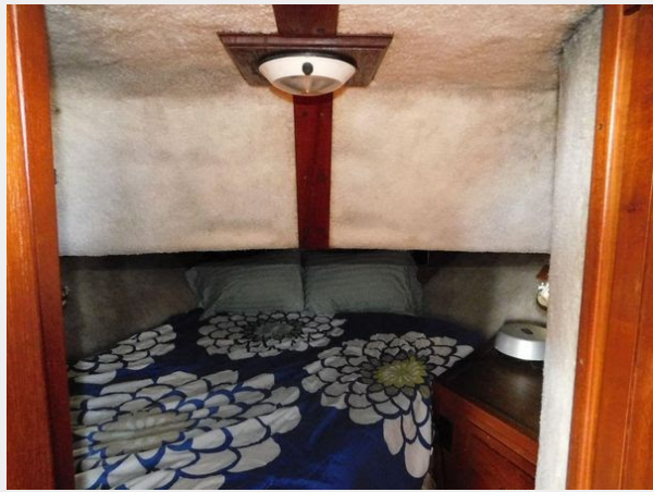
Bluewater 51 Coastal Cruiser - Guest Cabin