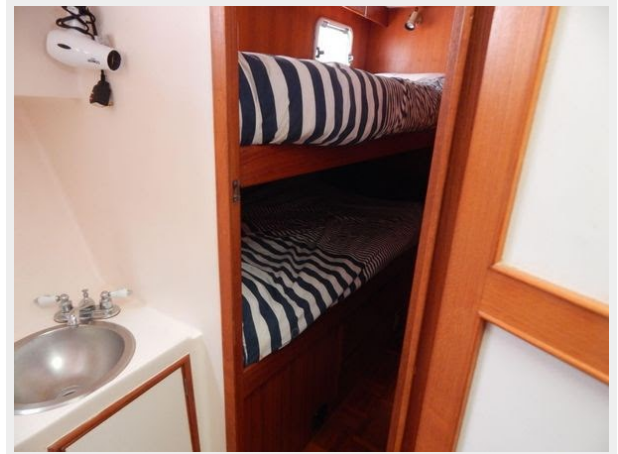
CHB 45 Trawler - Guest Cabin 2