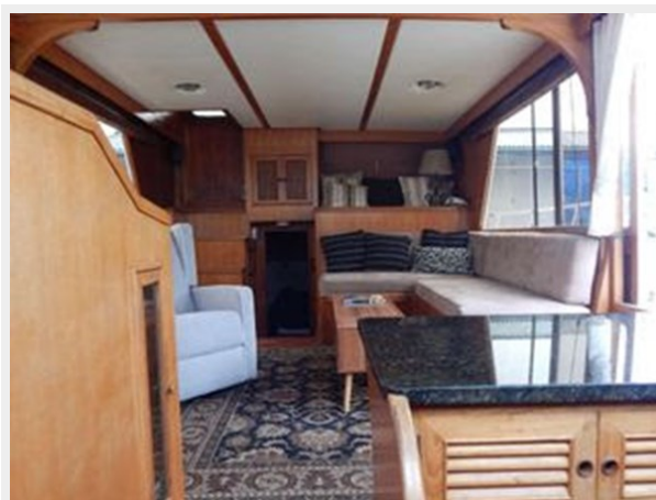
CHB 45 Trawler - Looking Aft