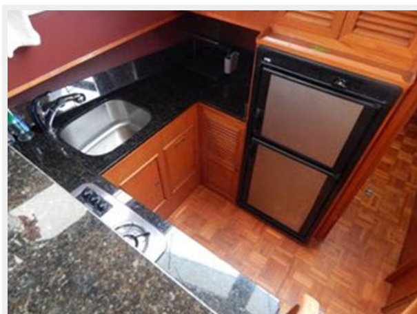
CHB 45 Trawler - Galley