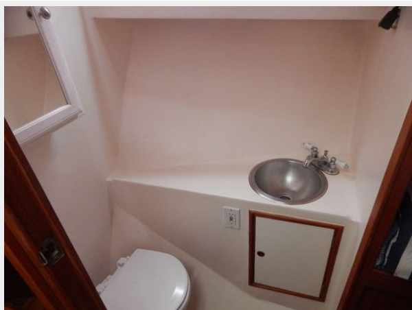
CHB 45 Trawler - Head