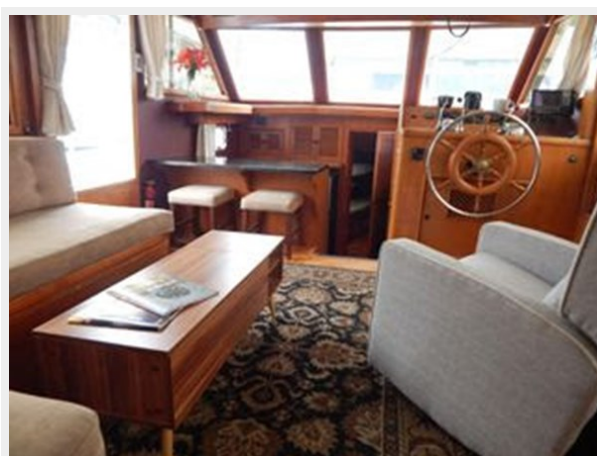
CHB 45 Trawler - Salon