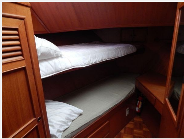
CHB 45 Trawler - Guest Cabin