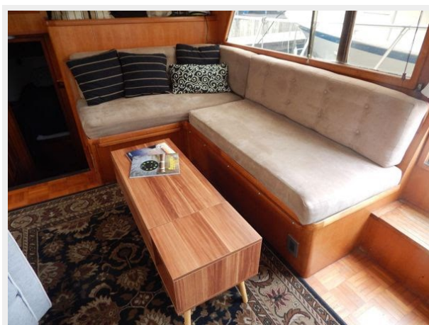
CHB 45 Trawler - Salon Table