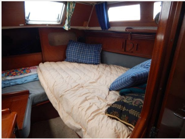
Amel Maramu 46 Ketch - Master Suite