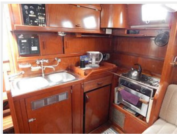
Amel Maramu 46 Ketch - Galley