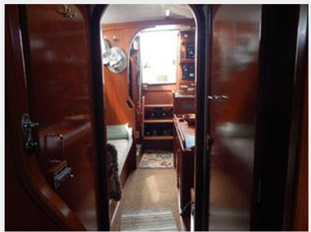
Amel Maramu 46 Ketch - Looking Aft