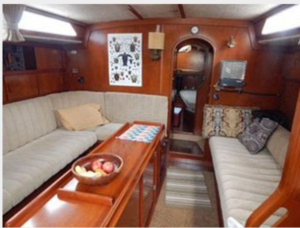
Amel Maramu 46 Ketch - Looking Forward