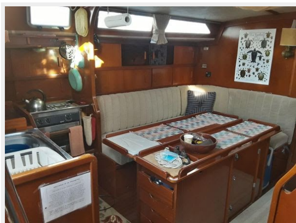
Amel Maramu 46 Ketch - Saloon Table