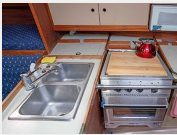
C&C 38 - Galley