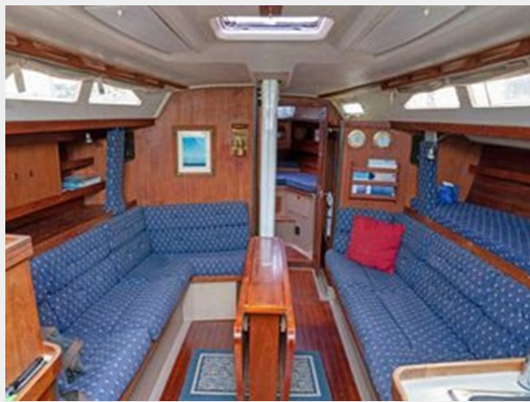
C&C 38 - Looking Forward