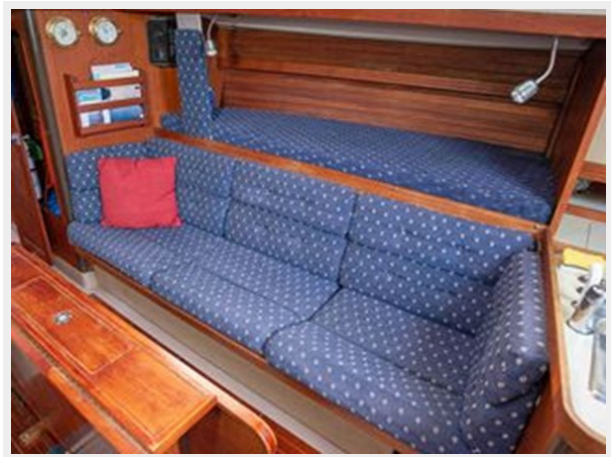
C&C 38 - Saloon