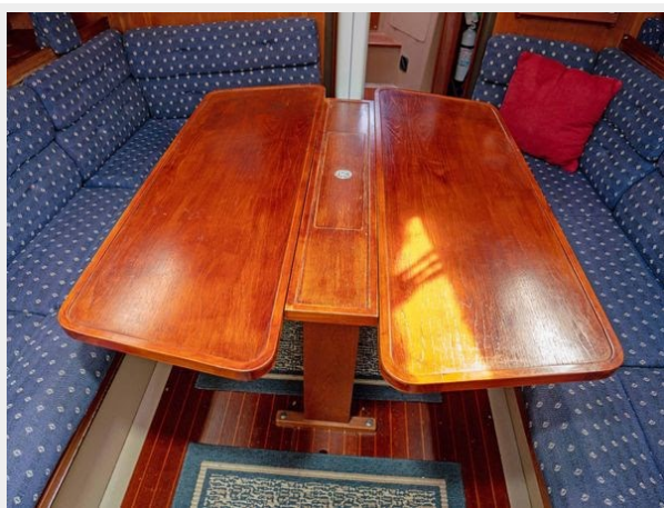
C&C 38 - Saloon Table