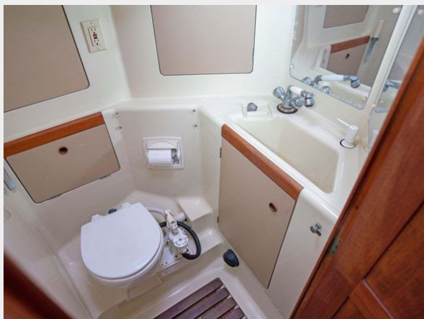
C&C 38 - Head