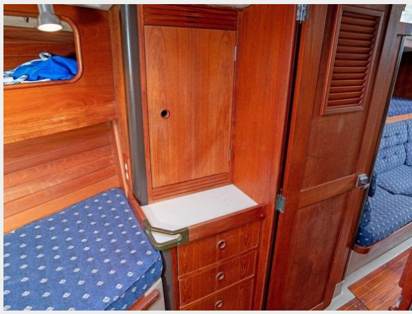
C&C 38 - Forward Cabin Storage