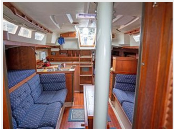
C&C 38 - Looking Aft