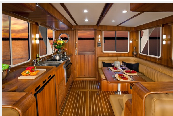
Helmsman Trawlers 38 Sedan Looking Aft