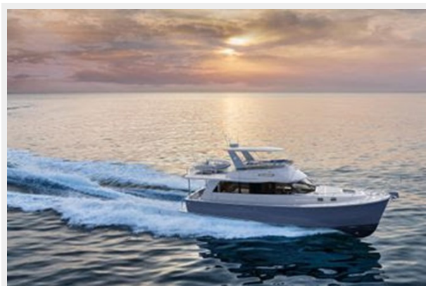
Helmsman Trawlers 43 Sedan Rendition 4