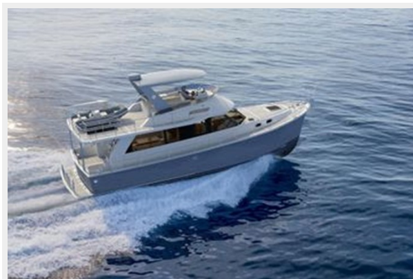
Helmsman Trawlers 43 Sedan Rendition 3