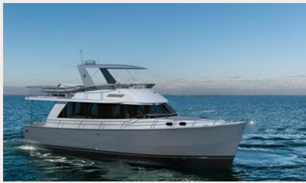
Helmsman Trawlers 43 Sedan Rendition 2