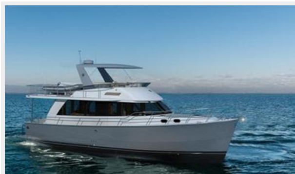
Helmsman Trawlers 43 Sedan Rendition 2