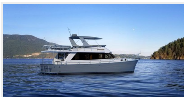
Helmsman Trawlers 43 Sedan Rendition 6