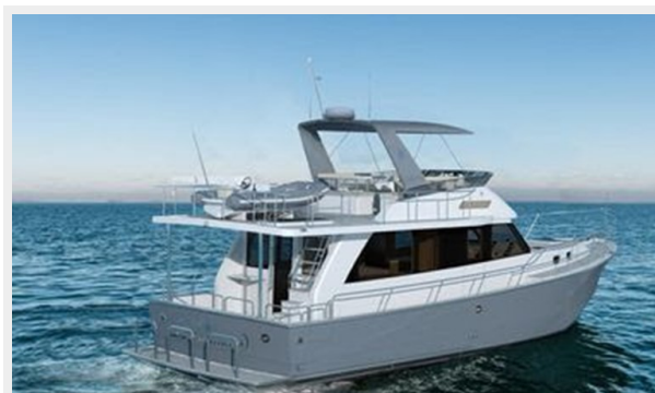
Helmsman Trawlers 43 Sedan Rendition 5