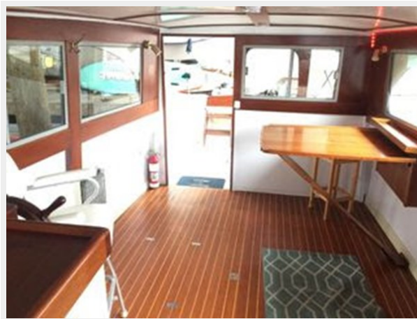
Richardson Deluxe Sedan Cruiser 34 - Looking Aft