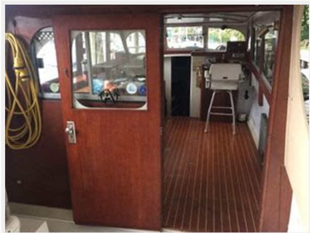
Richardson Deluxe Sedan Cruiser 34 - Looking Forward