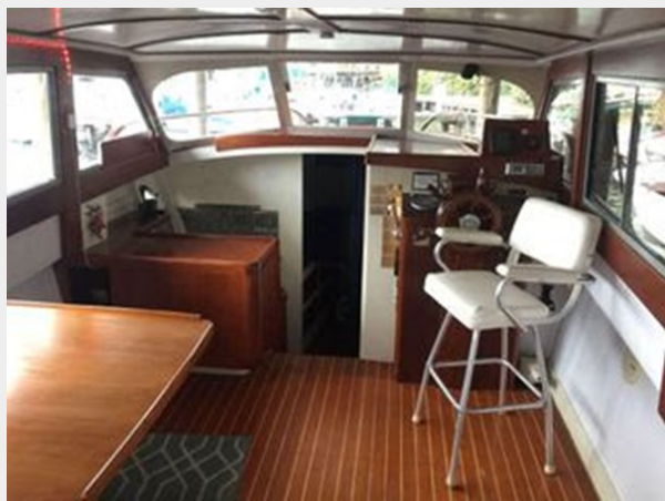
Richardson Deluxe Sedan Cruiser 34 - Salon