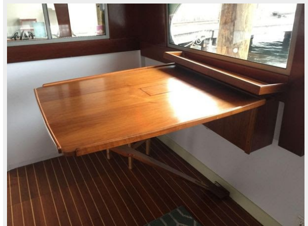
Richardson Deluxe Sedan Cruiser 34 - Salon Table