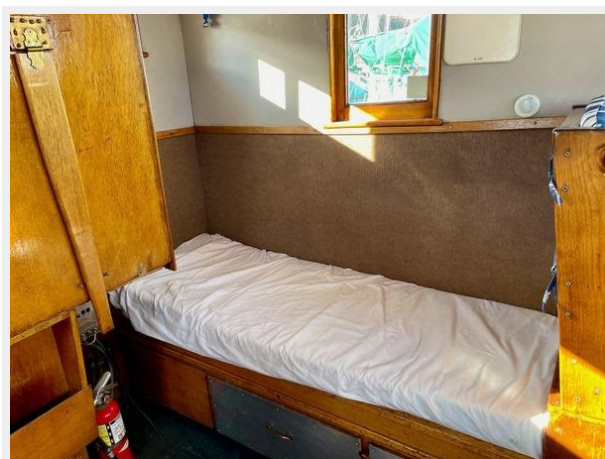
Stockland 36 Trawler Conversion - Salon