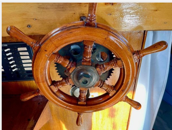
Stockland 36 Trawler Conversion - Helm