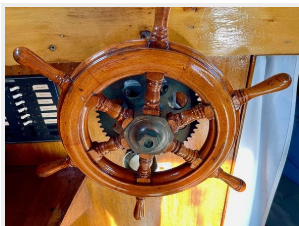
Stockland 36 Trawler Conversion - Helm