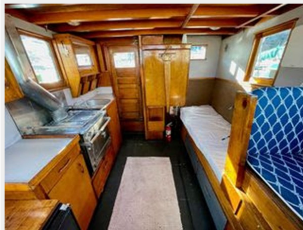
Stockland 36 Trawler Conversion - Looking Aft