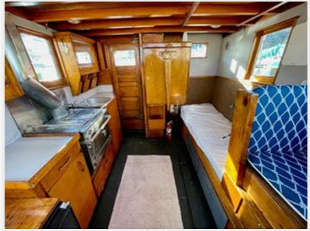
Stockland 36 Trawler Conversion - Looking Aft