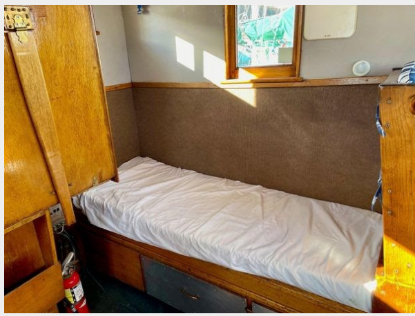
Stockland 36 Trawler Conversion - Salon