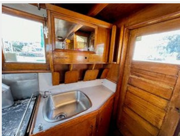
Stockland 36 Trawler Conversion - Galley