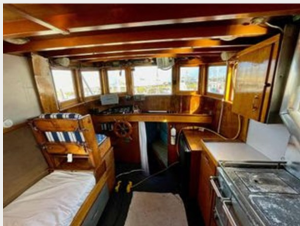
Stockland 36 Trawler Conversion - Looking Forward