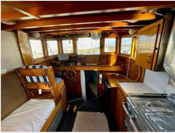
Stockland 36 Trawler Conversion - Looking Forward