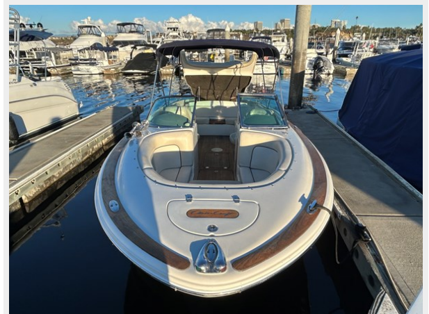
Open Bow with Bimini