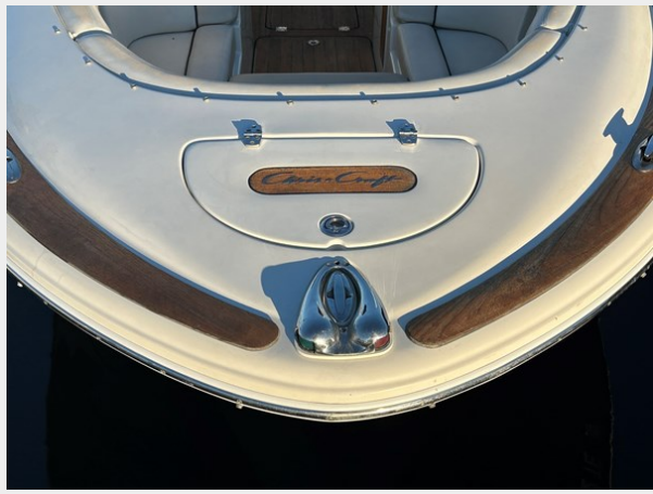
Bow Running Lights