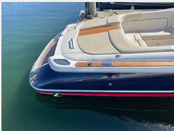
Starboard Stern Exterior