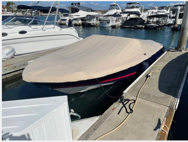
Port Bow Covered