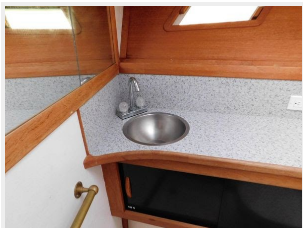
Trojan F-32 Flybridge Sportfish Sedan - Head