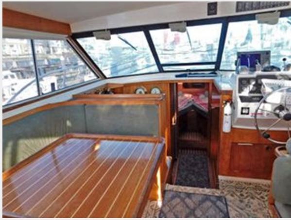
Trojan F-32 Flybridge Sportfish Sedan - Looking Forward