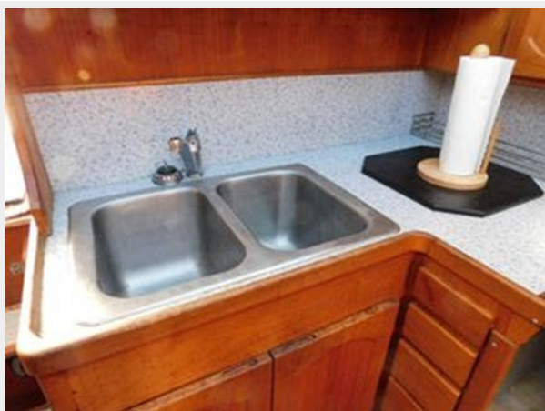
Trojan F-32 Flybridge Sportfish Sedan - Galley