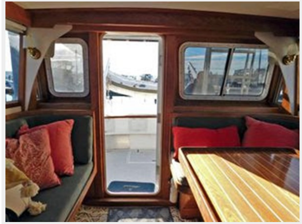
Trojan F-32 Flybridge Sportfish Sedan - Looking Aft