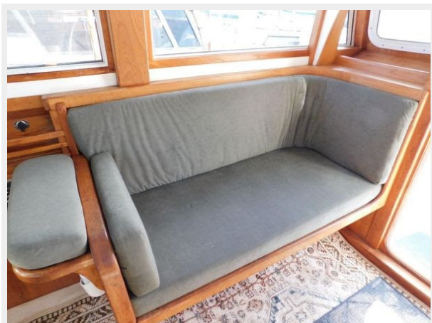
Trojan F-32 Flybridge Sportfish Sedan - Salon