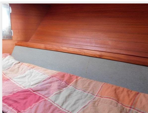
Trojan F-32 Flybridge Sportfish Sedan - Forward Cabin