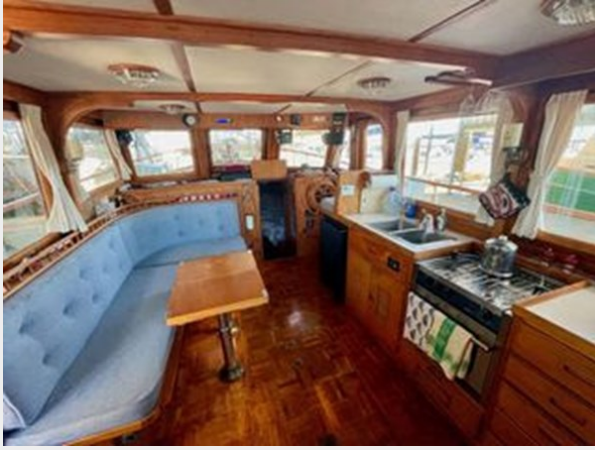
Universal 36 Trawler Tri-Cabin - Looking Forward