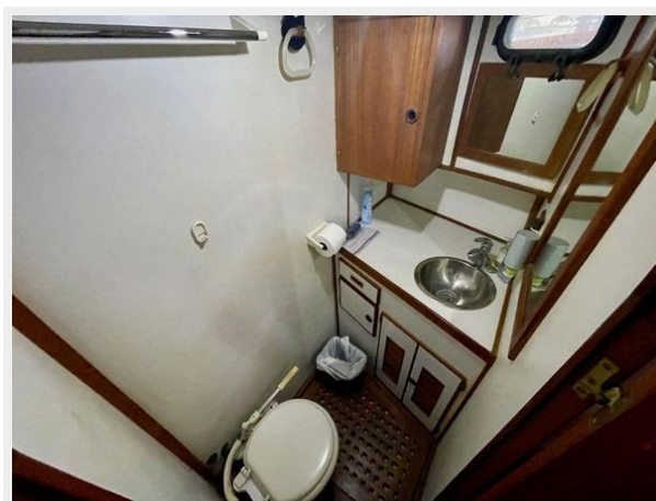
Universal 36 Trawler Tri-Cabin - Head