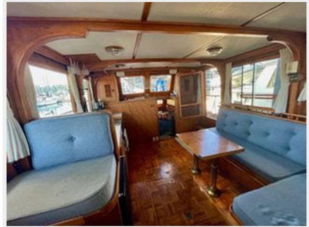
Universal 36 Trawler Tri-Cabin - Looking Aft