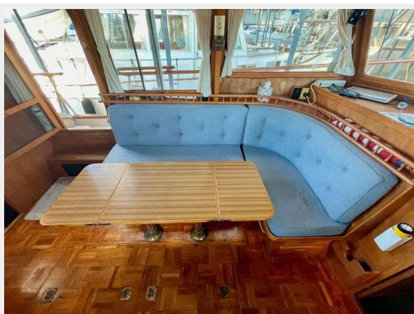
Universal 36 Trawler Tri-Cabin - Salon Table