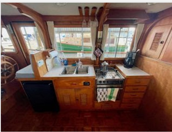
Universal 36 Trawler Tri-Cabin - Galley