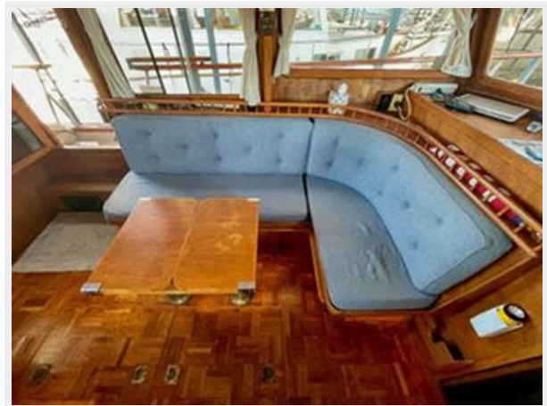
Universal 36 Trawler Tri-Cabin - Salon