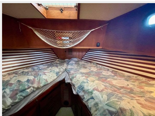
Universal 36 Trawler Tri-Cabin - Forward Cabin