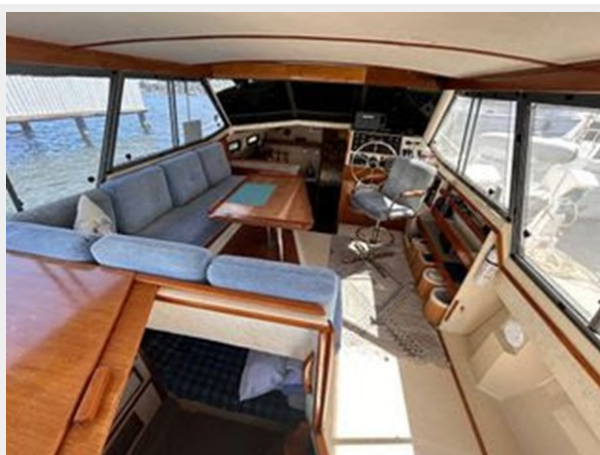
Bayliner 3270 Explorer - Looking Forward