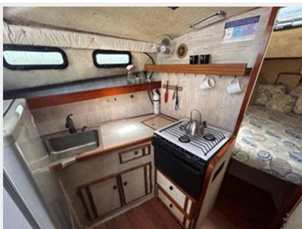
Bayliner 3270 Explorer - Galley