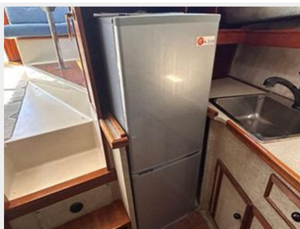
Bayliner 3270 Explorer - Galley Fridge