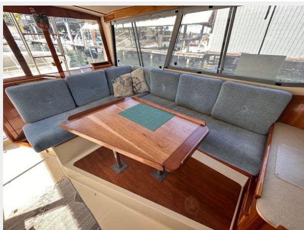
Bayliner 3270 Explorer - Salon