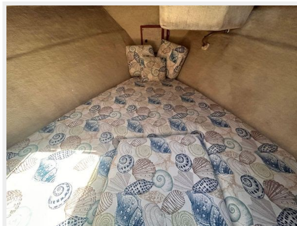
Bayliner 3270 Explorer - Forward Cabin