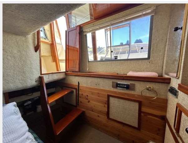
Bayliner 3270 Explorer - Aft Cabin