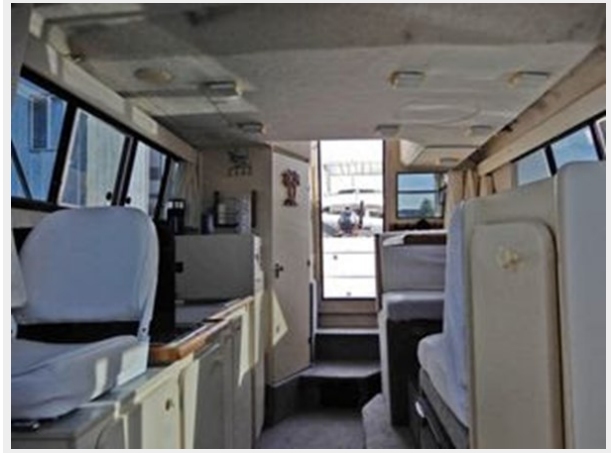
Bayliner 2858 Command Bridge - Looking Aft