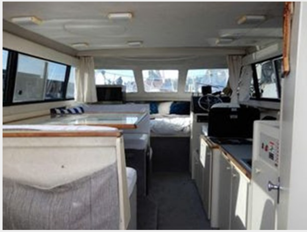
Bayliner 2858 Command Bridge - Looking Forward