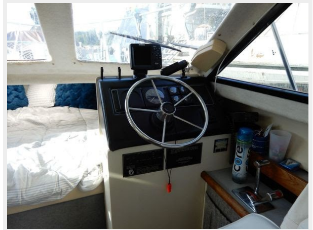
Bayliner 2858 Command Bridge - Helm