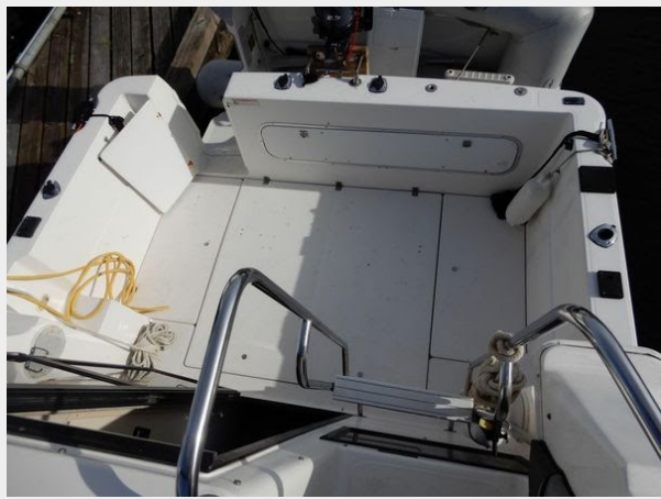
Bayliner 2858 Command Bridge - Cockpit