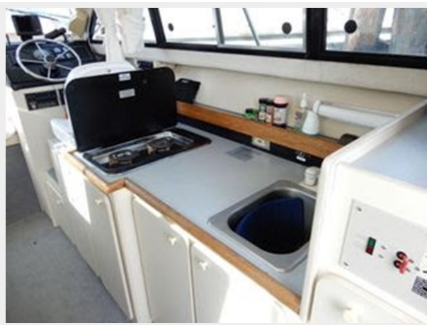
Bayliner 2858 Command Bridge - Galley