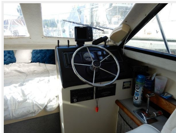
Bayliner 2858 Command Bridge - Helm