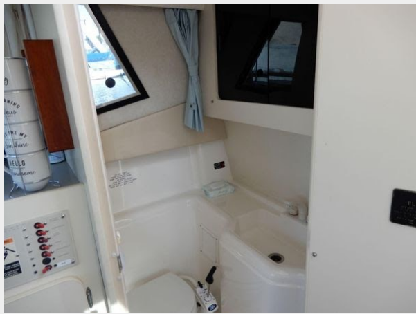
Bayliner 2858 Command Bridge - Head