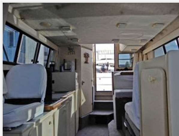
Bayliner 2858 Command Bridge - Looking Aft