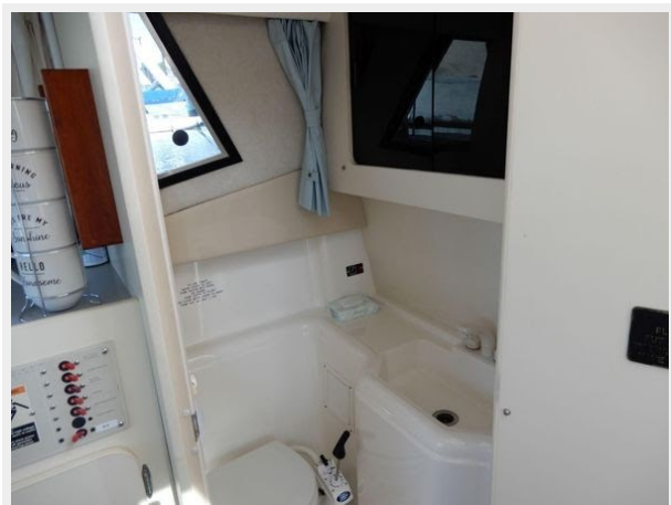
Bayliner 2858 Command Bridge - Head