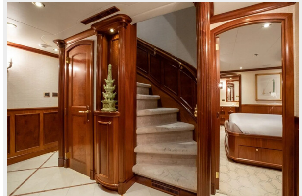
Stairs to Lower Deck