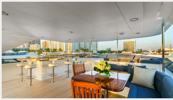
Sun Deck Bar