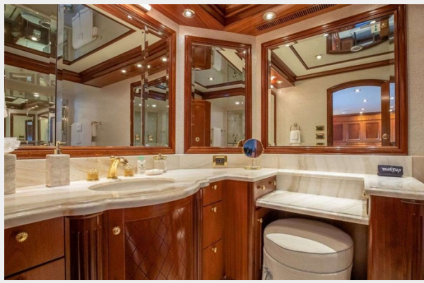
Main Deck - Master Ensuite