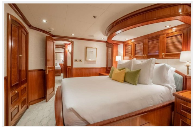
Lower Deck Guest Stateroom