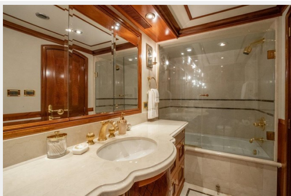
Lower Deck Ensuite