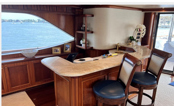
Main Deck Bar