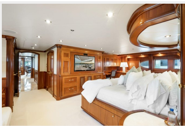
Main Deck Master Stateroom