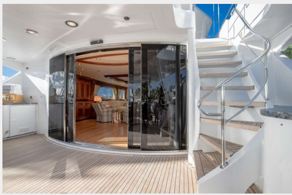
Bridge - Aft Deck