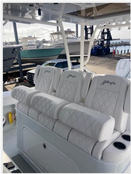
Yf42 Helm Seating