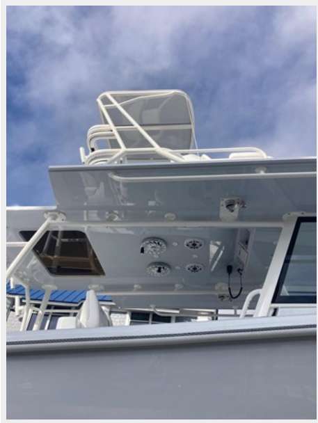
YF42 Below Top