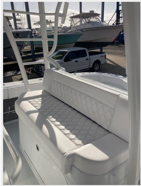
YF42 Double Row