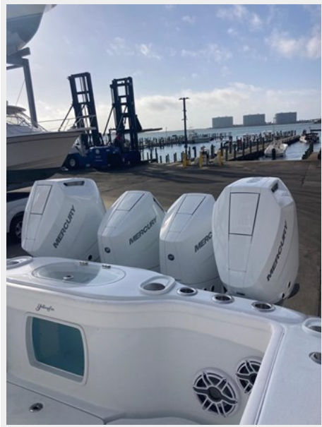
YF42 Interior Motors