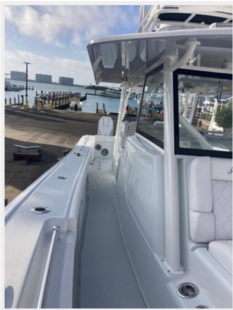
YF42 Interior Starbord