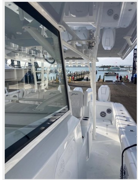
YF42 Interior Port