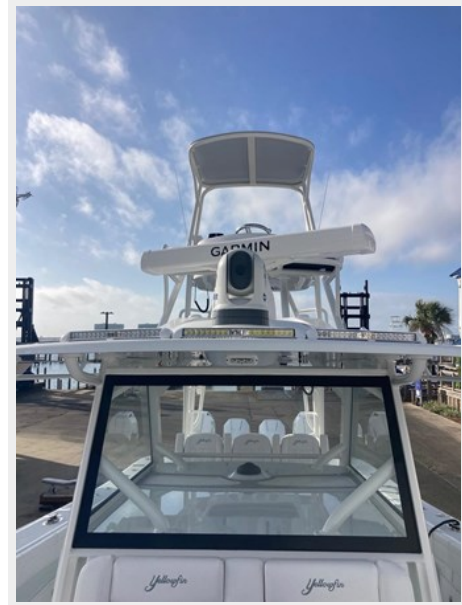
YF42 Front Console