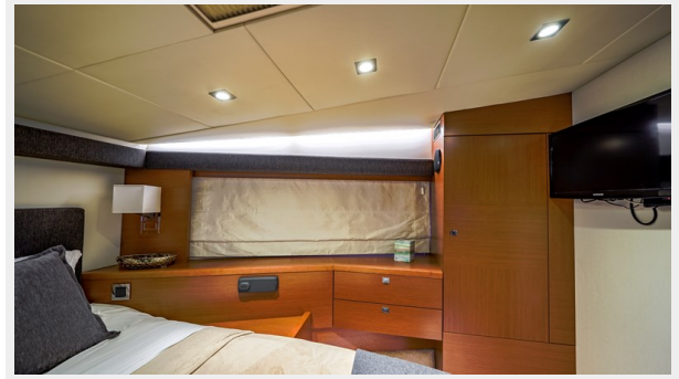
Bow VIP Stateroom